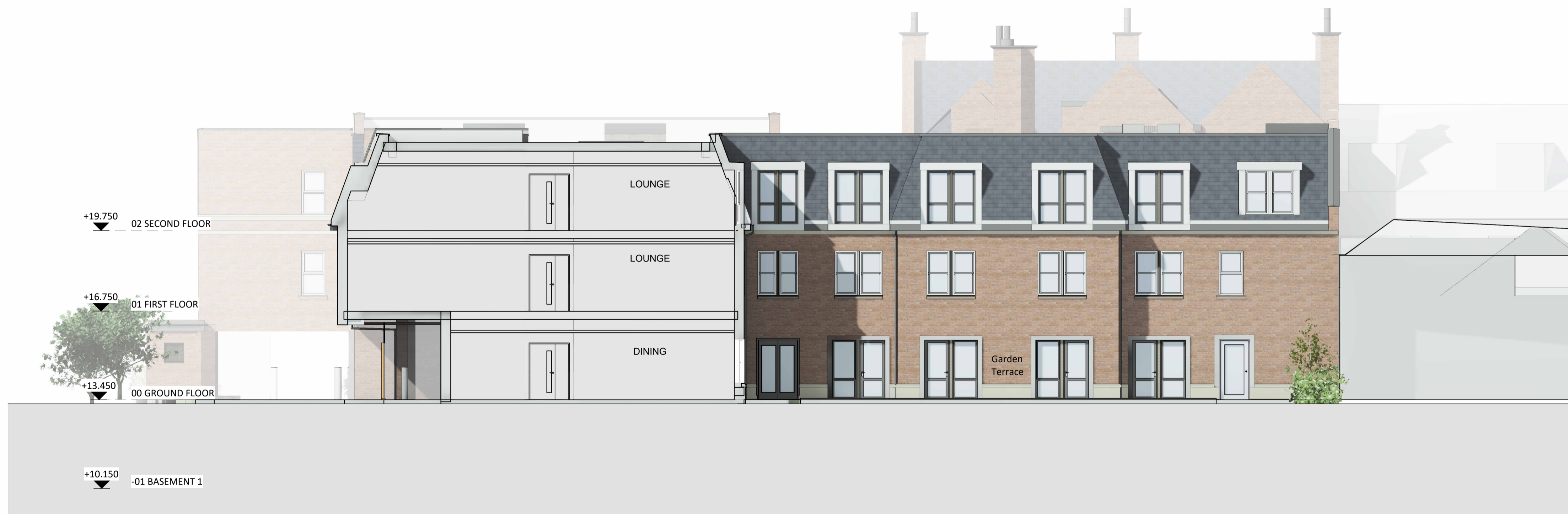
SECTION D1 - NORT ELEVATION THROUGH REAR GARDEN 1 : 100