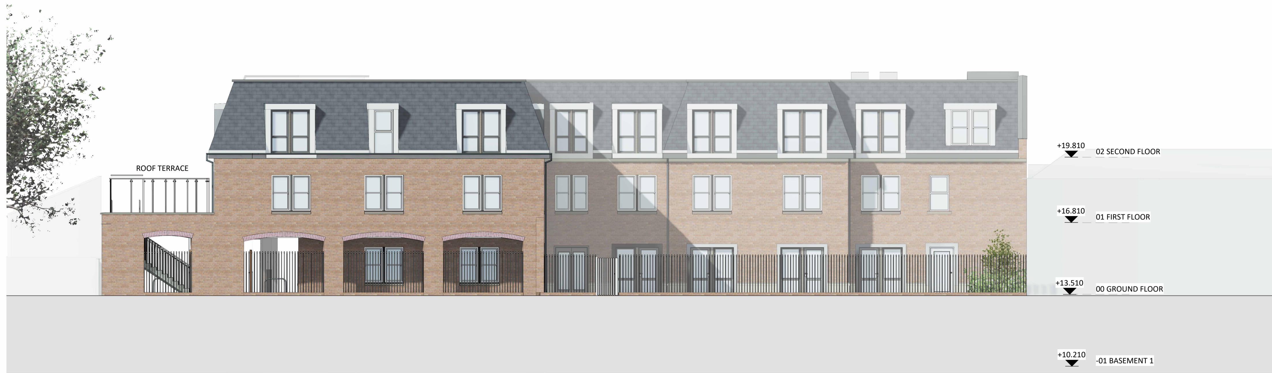
ELEVATION D - NORTH ELEVATION 1 : 100