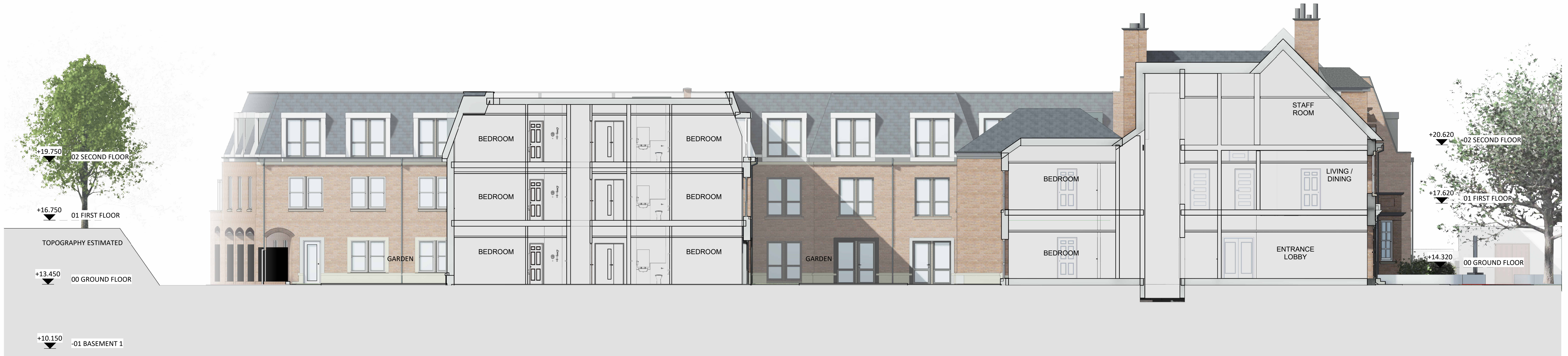
SECTION BB - WEST ELEVATION / SITE CROSS SECTION 1 : 100