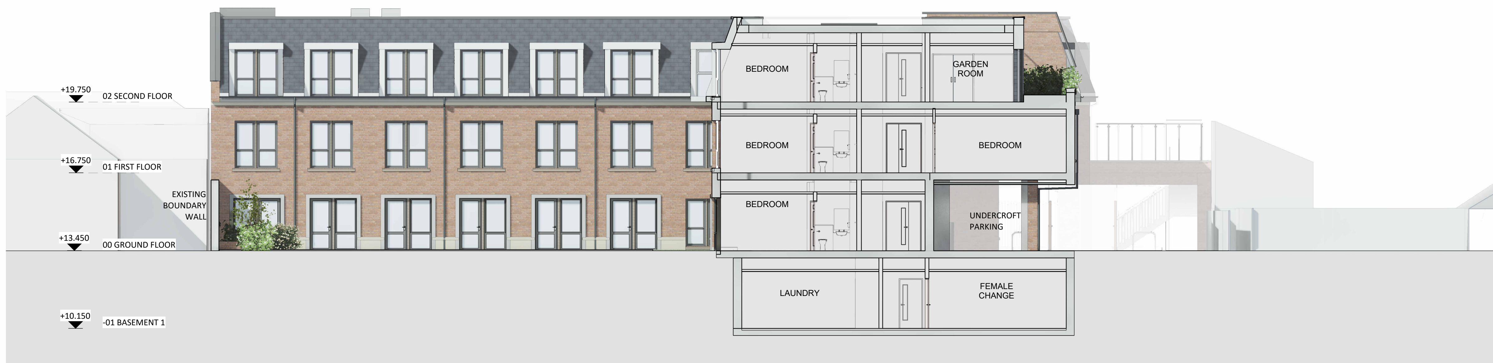
SECTION CC - SOUTH ELEVATION THROUGH COURTYARD GARDEN 1 : 100