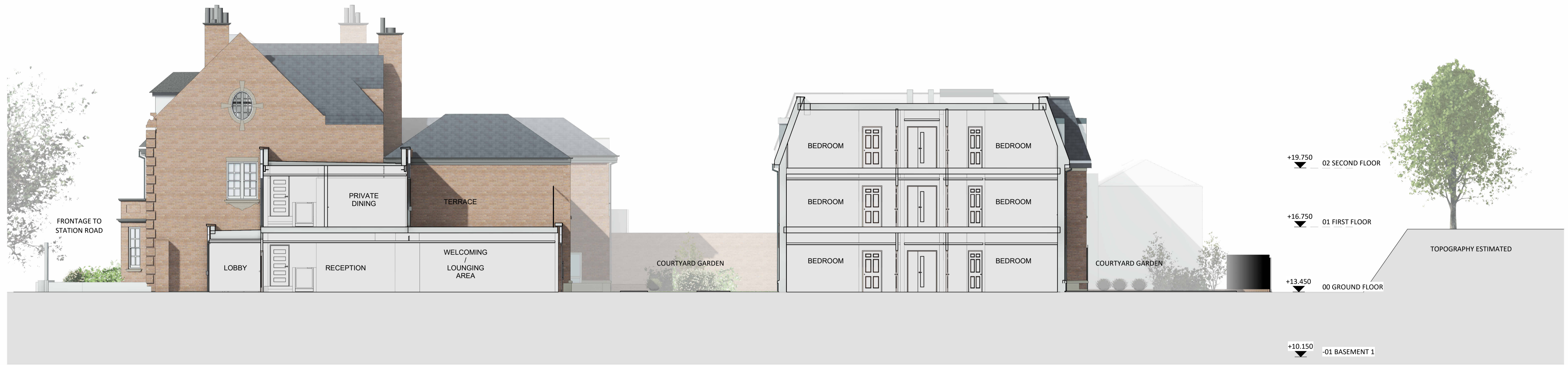
ELEVATION / SECTION G 1 : 100