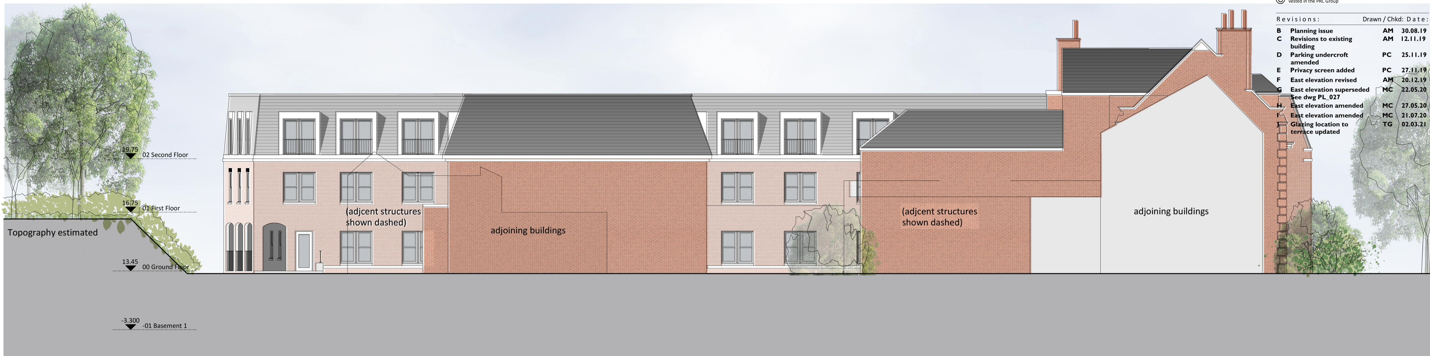
Elevation E - West Elevation 1:100