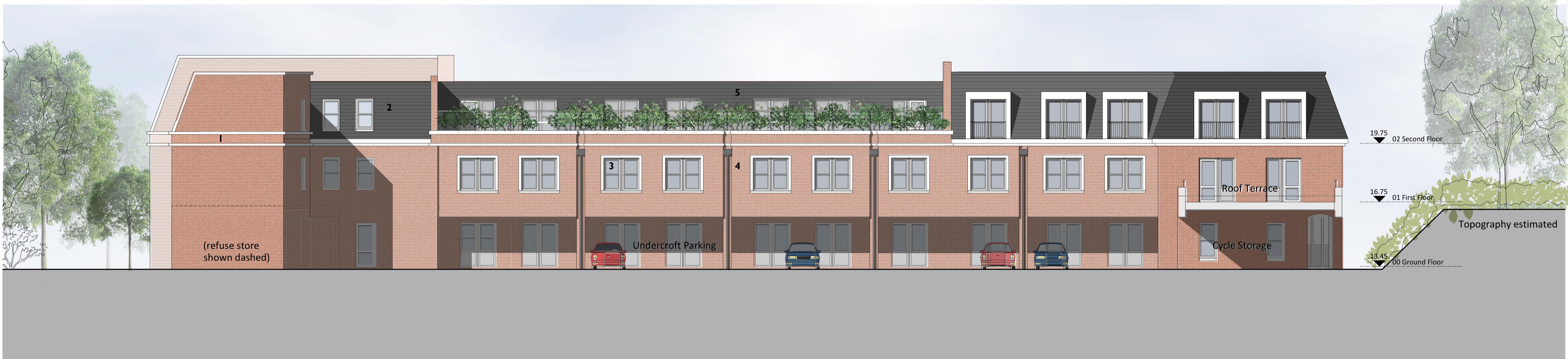
Elevation F - East Elevation 1:100