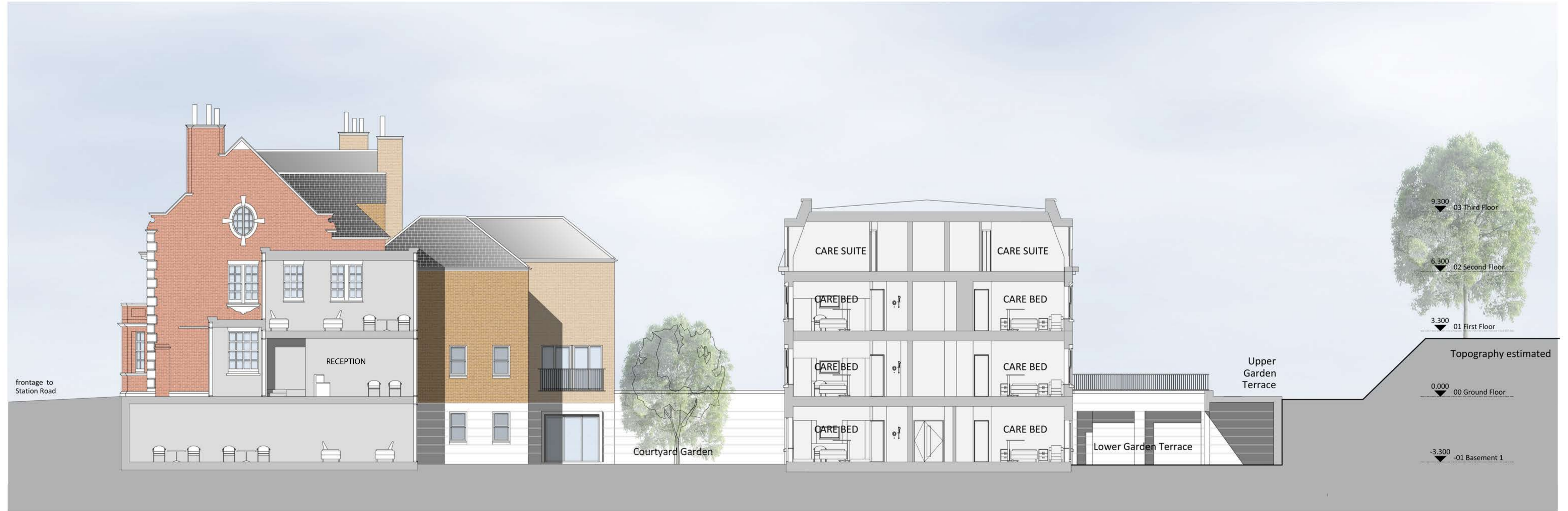
Elevation/Section G I:100