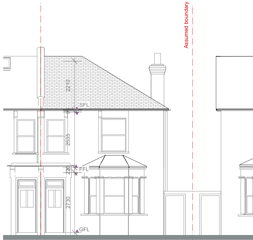
1 Front elevation survey Scale: 1:100

GENERAL NOTES: Do not scale from this drawing. Dimensions must be checked on site. This drawing is copyright of Grainne O'Keeffe Architects. This drawing cannot be copied or used in any way without the express permission of Grainne O'Keeffe Architects. Neighbouring properties not surveyed unless stated