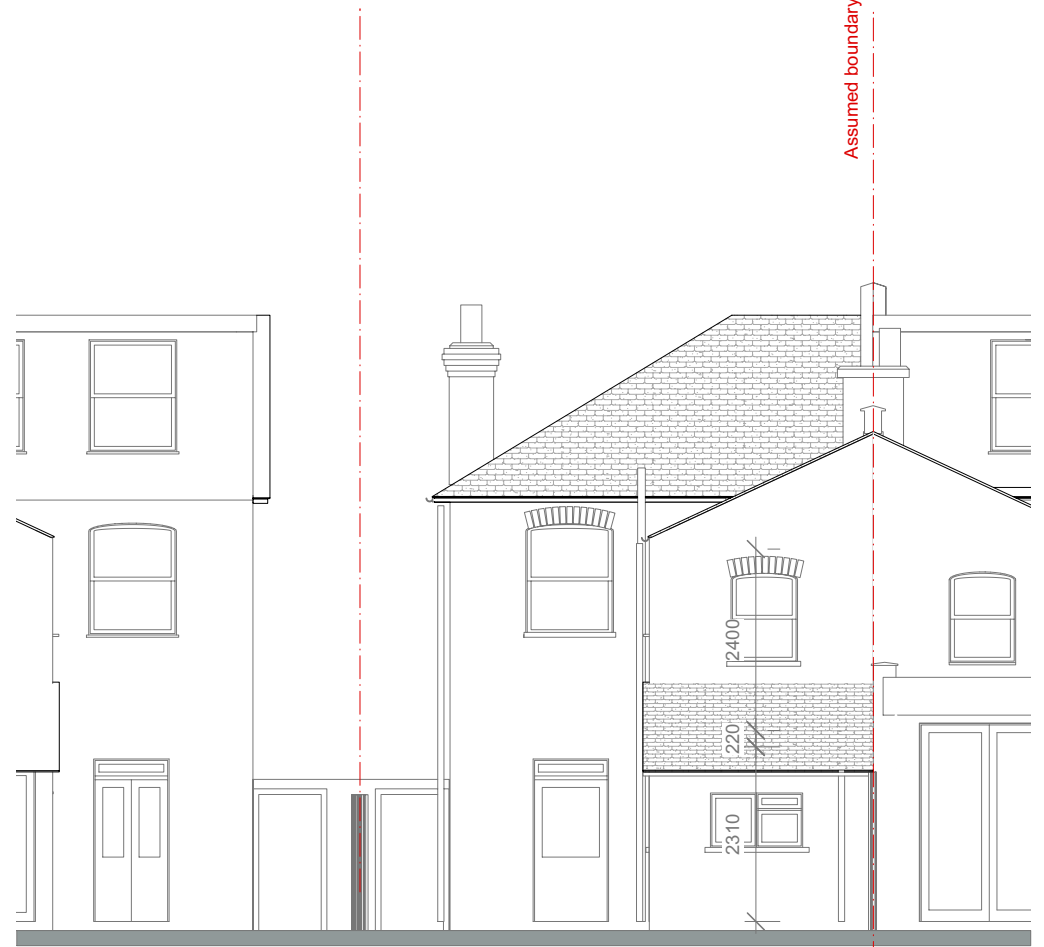
2 Rear elevation survey Scale: 1:100