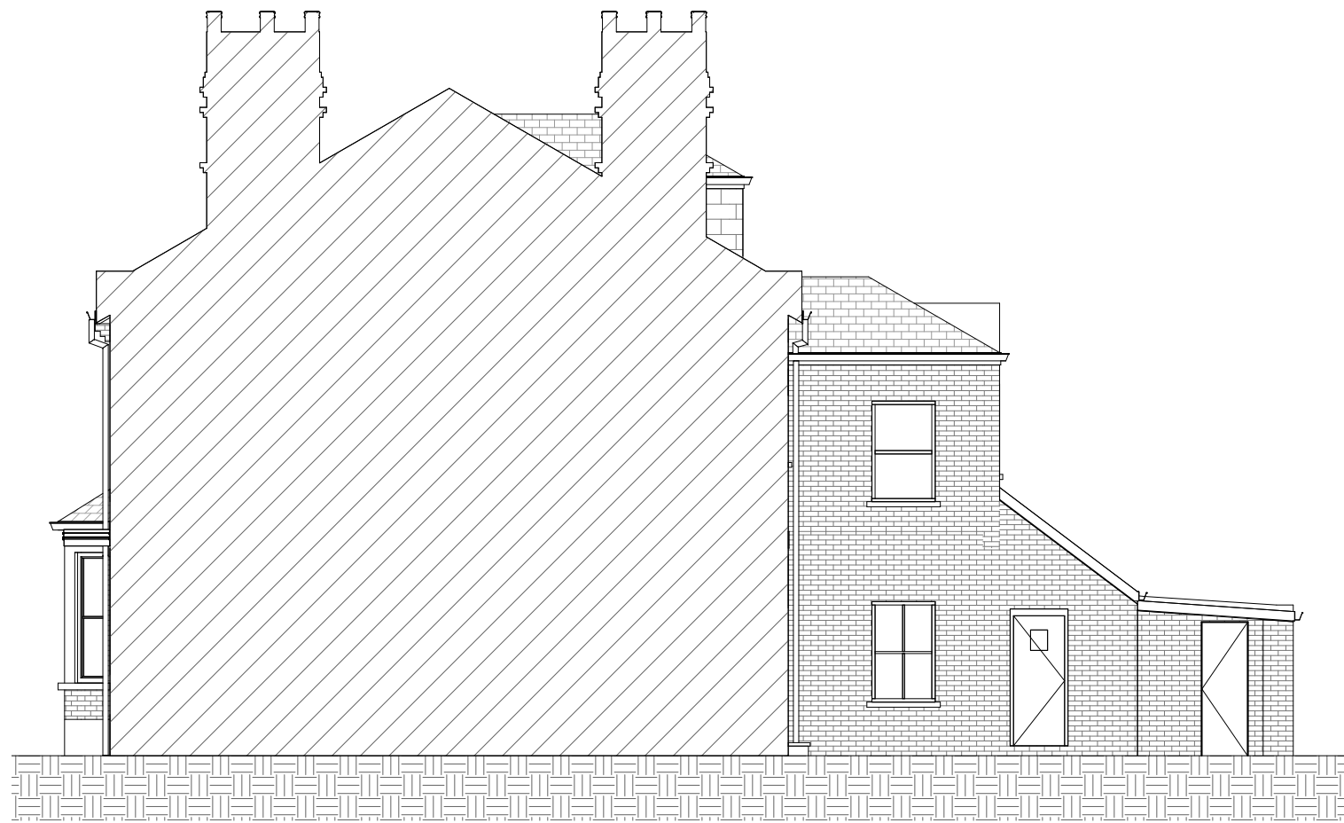
Existing side Elevation ( From No -6)