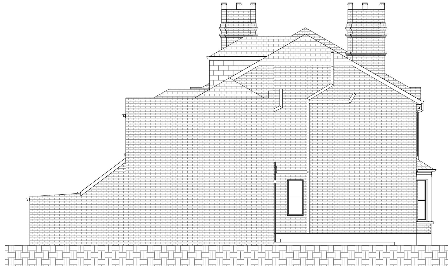
Existing side Elevation ( From No - 10)