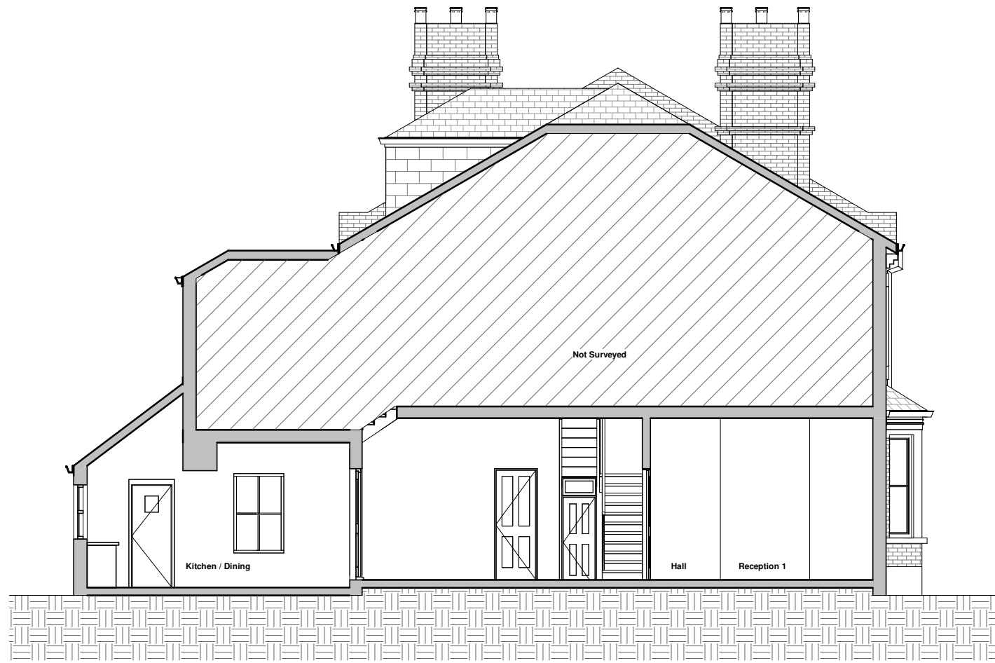
Existing Section AA'