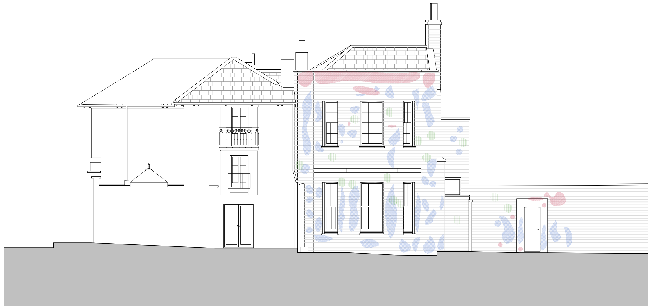
Existing North Elevation EE scale 1:100