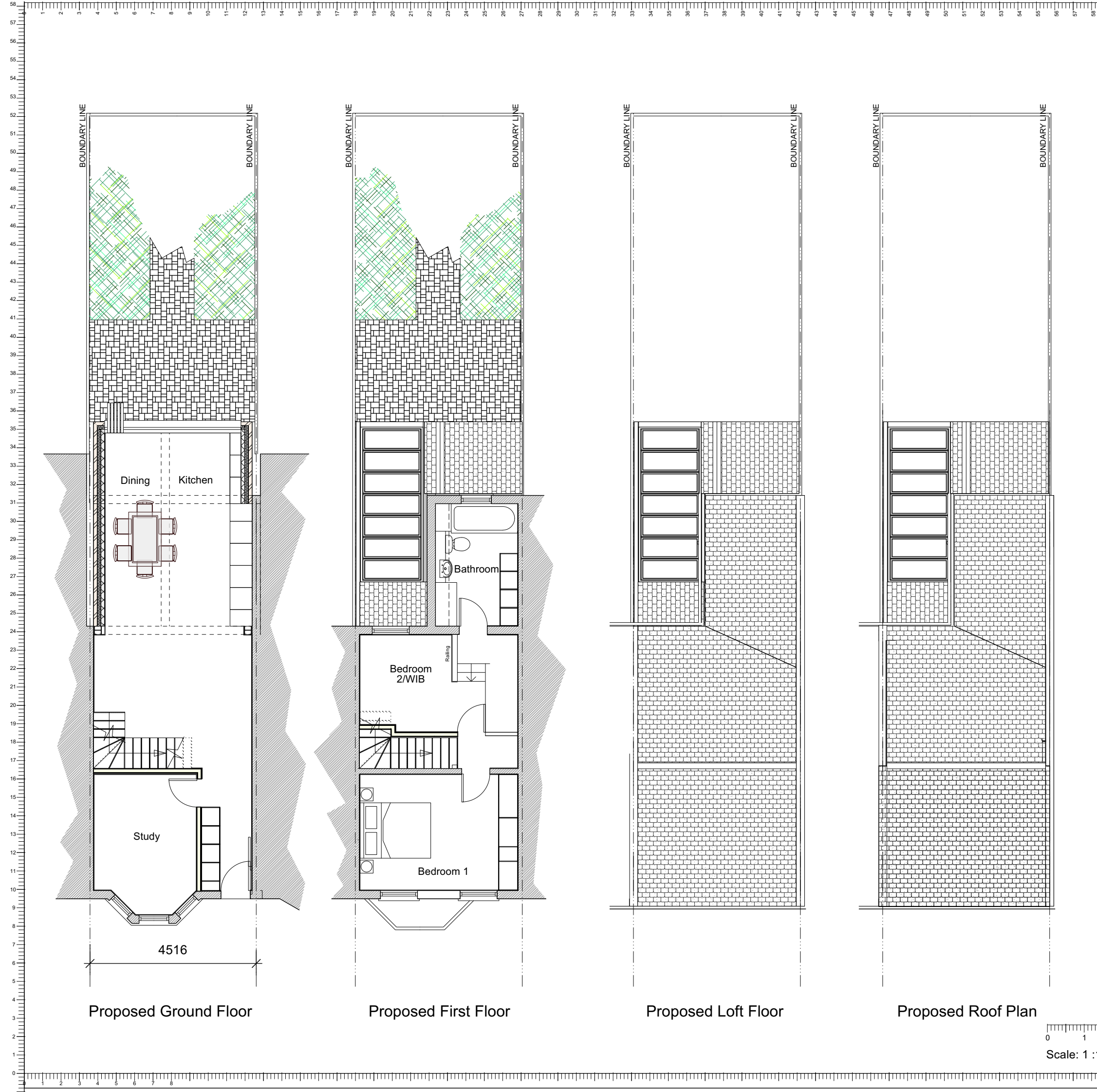
Proposed Ground Floor