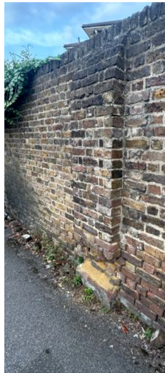
DETAIL C (pier lower section)