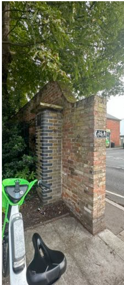
DETAIL A (vent)