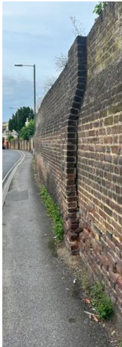
DETAIL B (split stretchers pier not connected)