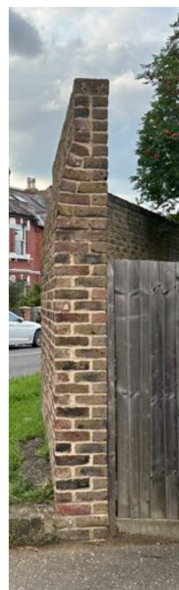
DETAIL D typical wall construction with upper tapering