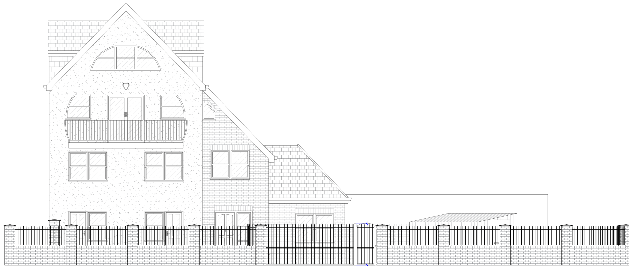
PROPOSED STREET ELEVATION