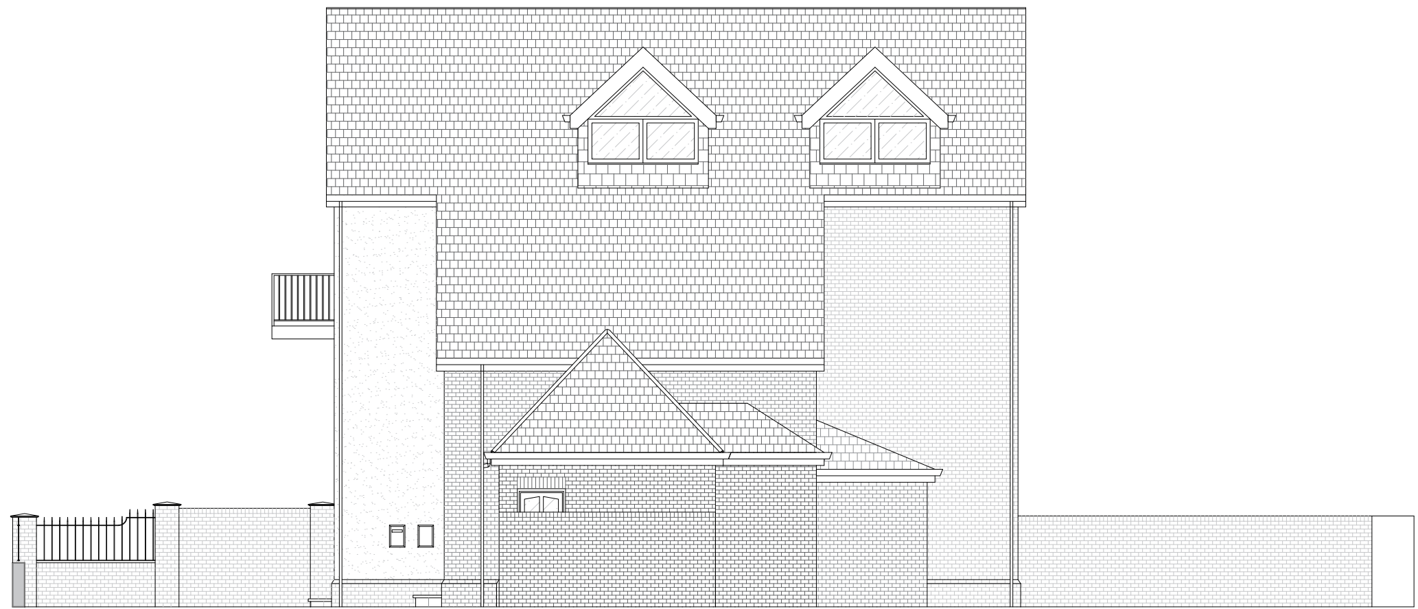
EXISTING SIDE (EAST) ELEVATION