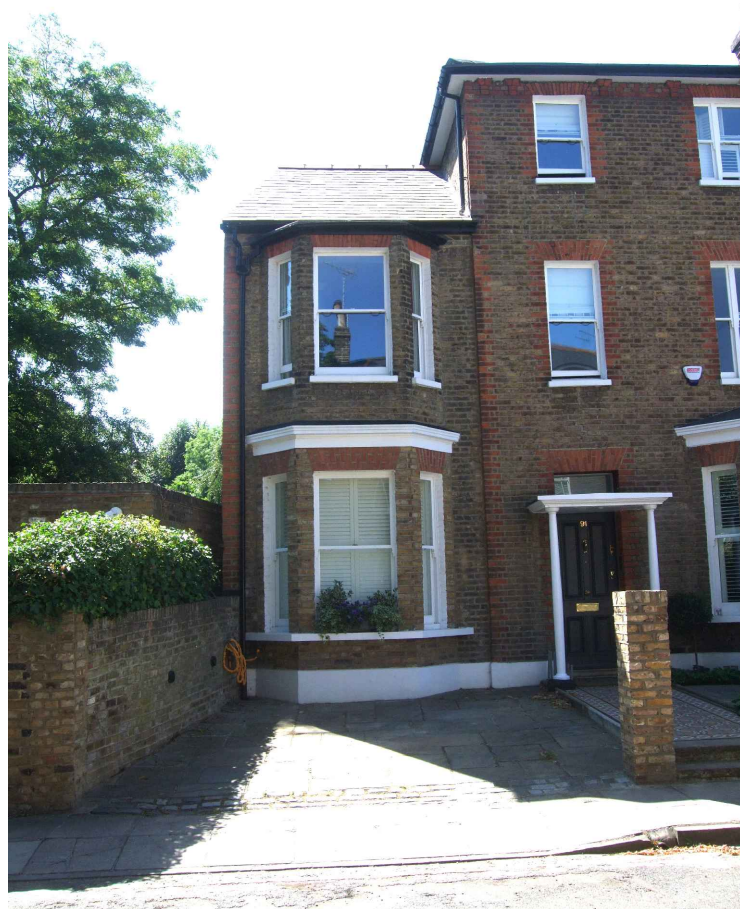
PREVIOUS 2 STOREY SIDE EXTENSION TO No.91 THE VINEYARD

THIS DRAWING IS THE COPYRIGHT OF THE ARCHITECT