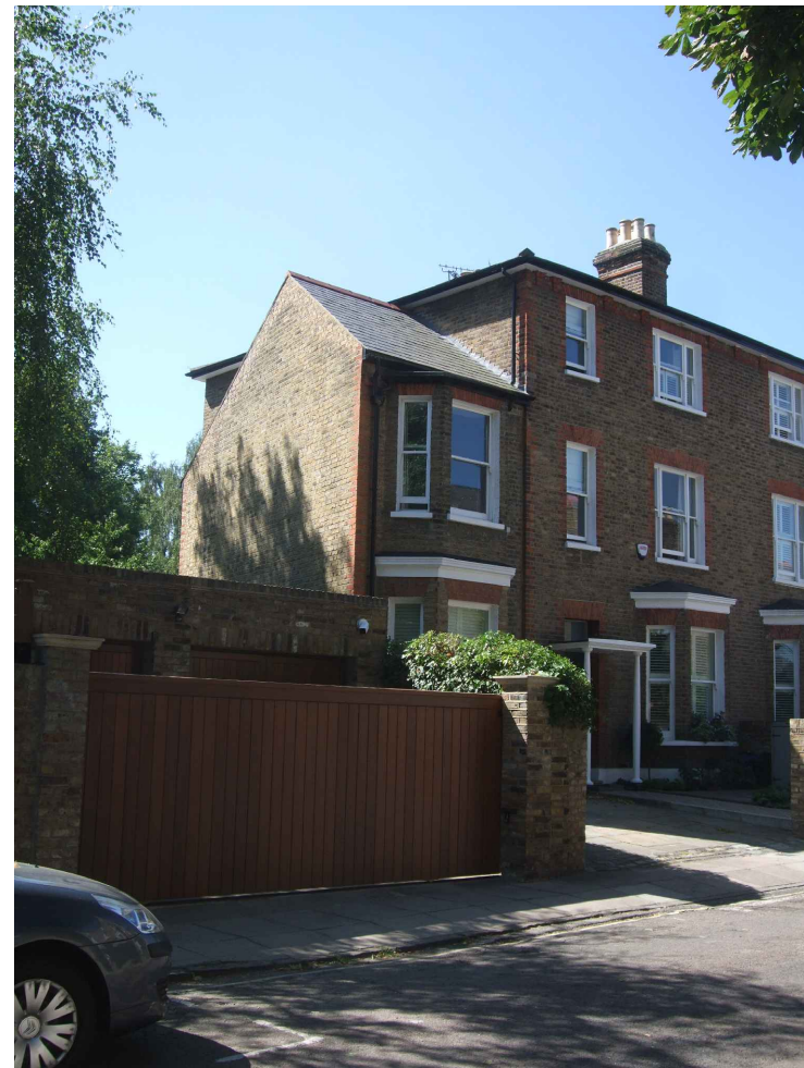
PREVIOUS 2 STOREY SIDE EXTENSION TO No.91 THE VINEYARD