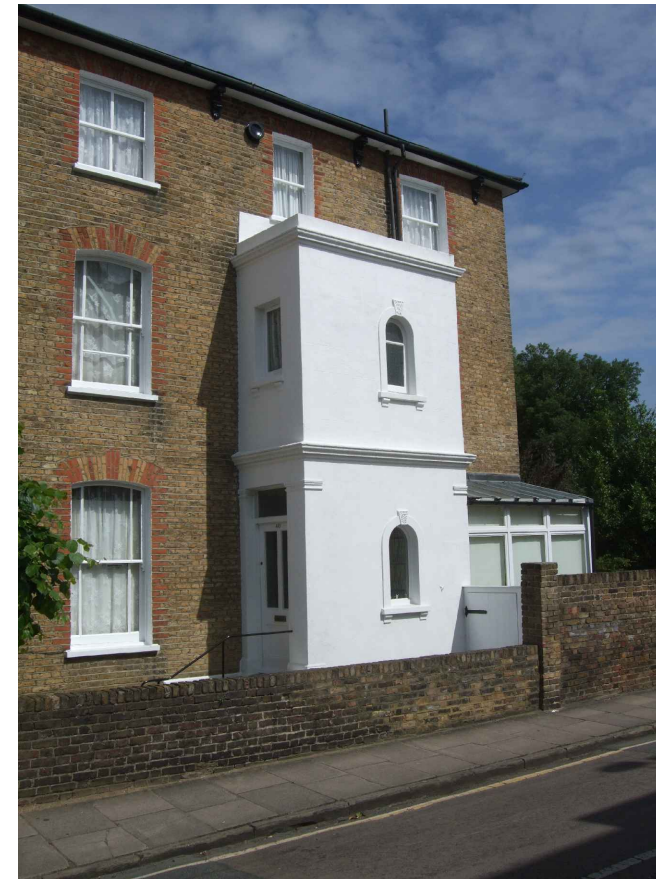
SIDE ENTRANCE TO 40 MOUNT ARARAT ROAD - PROPOSED EXTENSION IS TO SIMILAR DESIGN