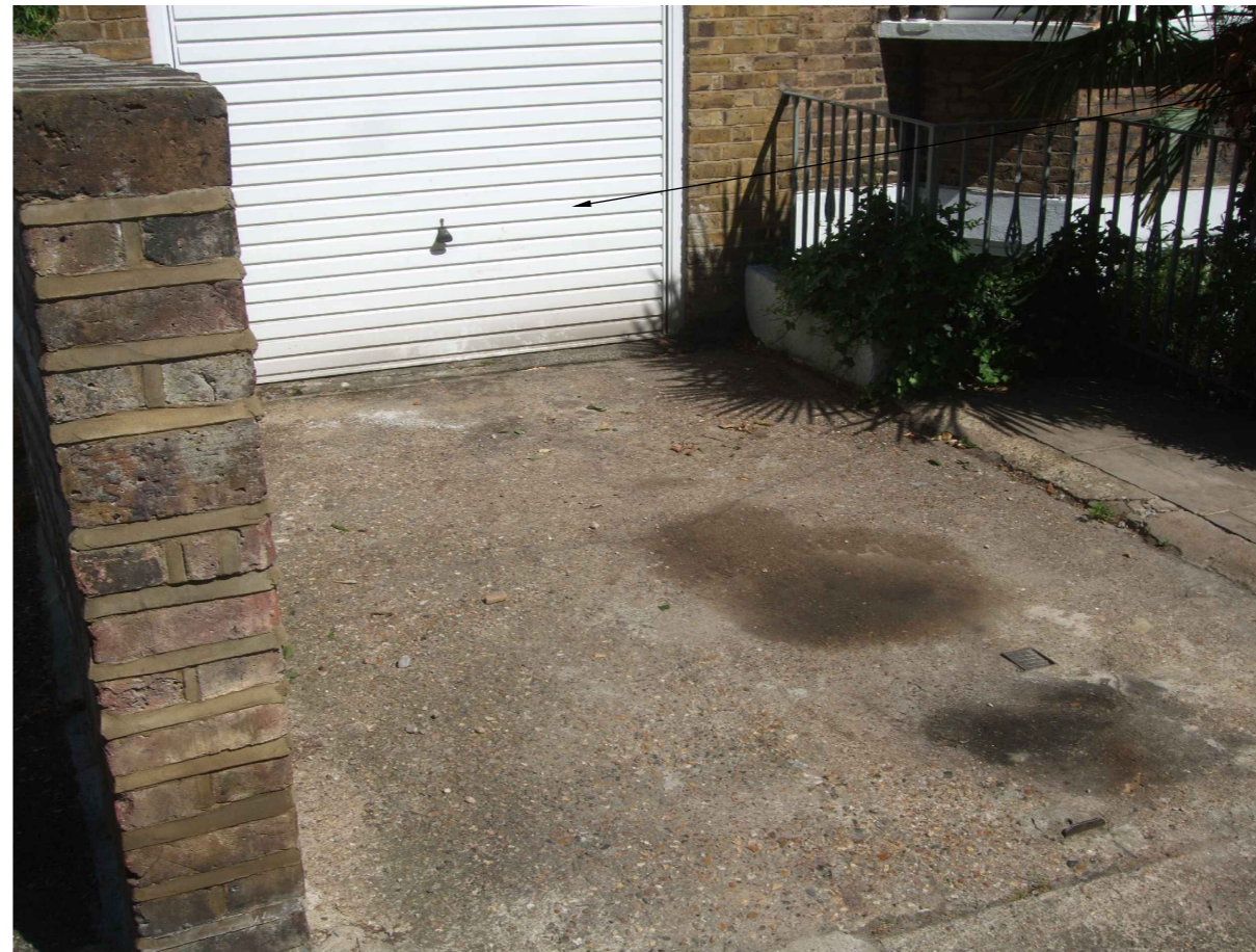
FRONT OF EXISTING GARAGE