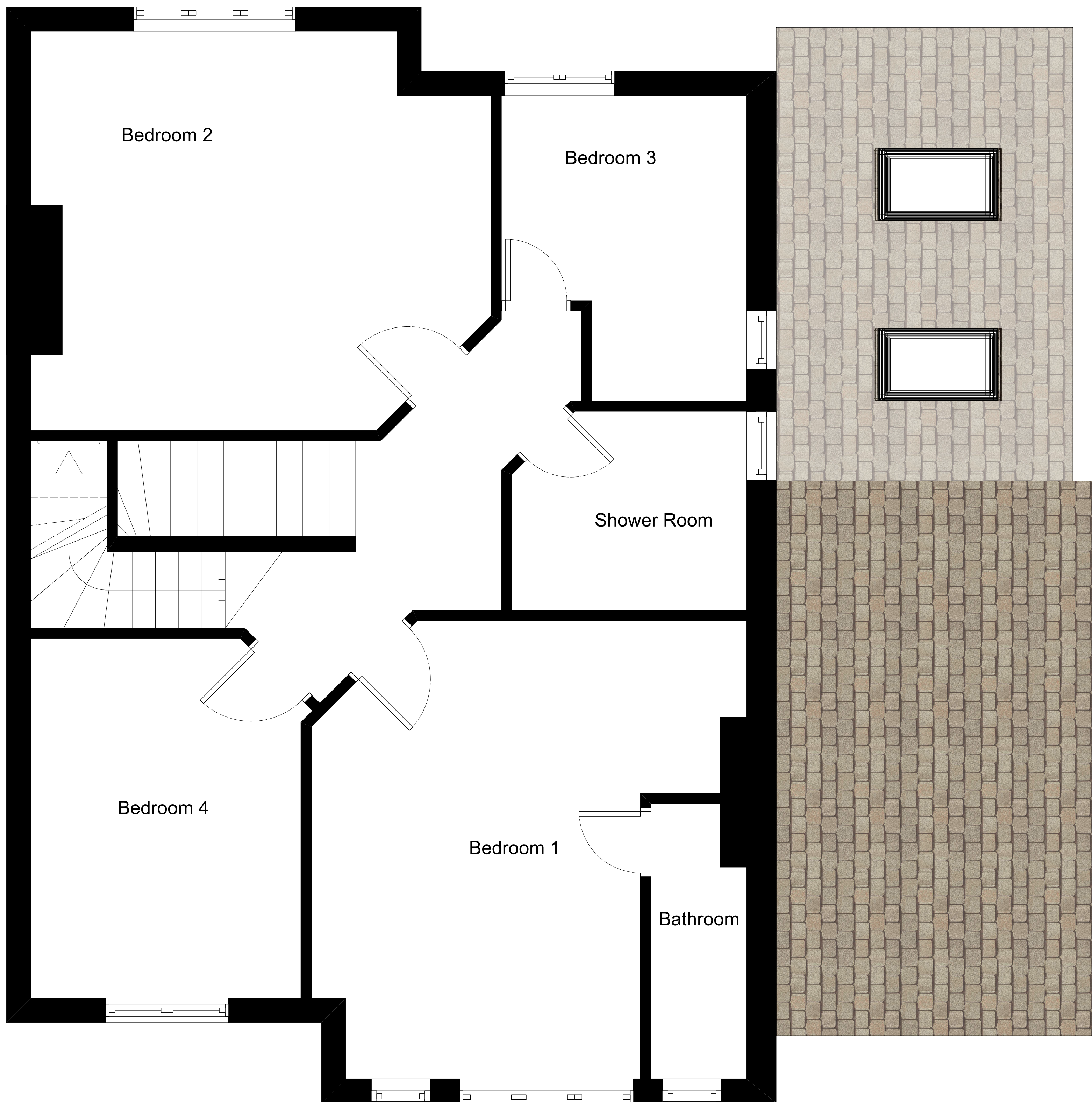
1 Ground Floor Scale: 1:25