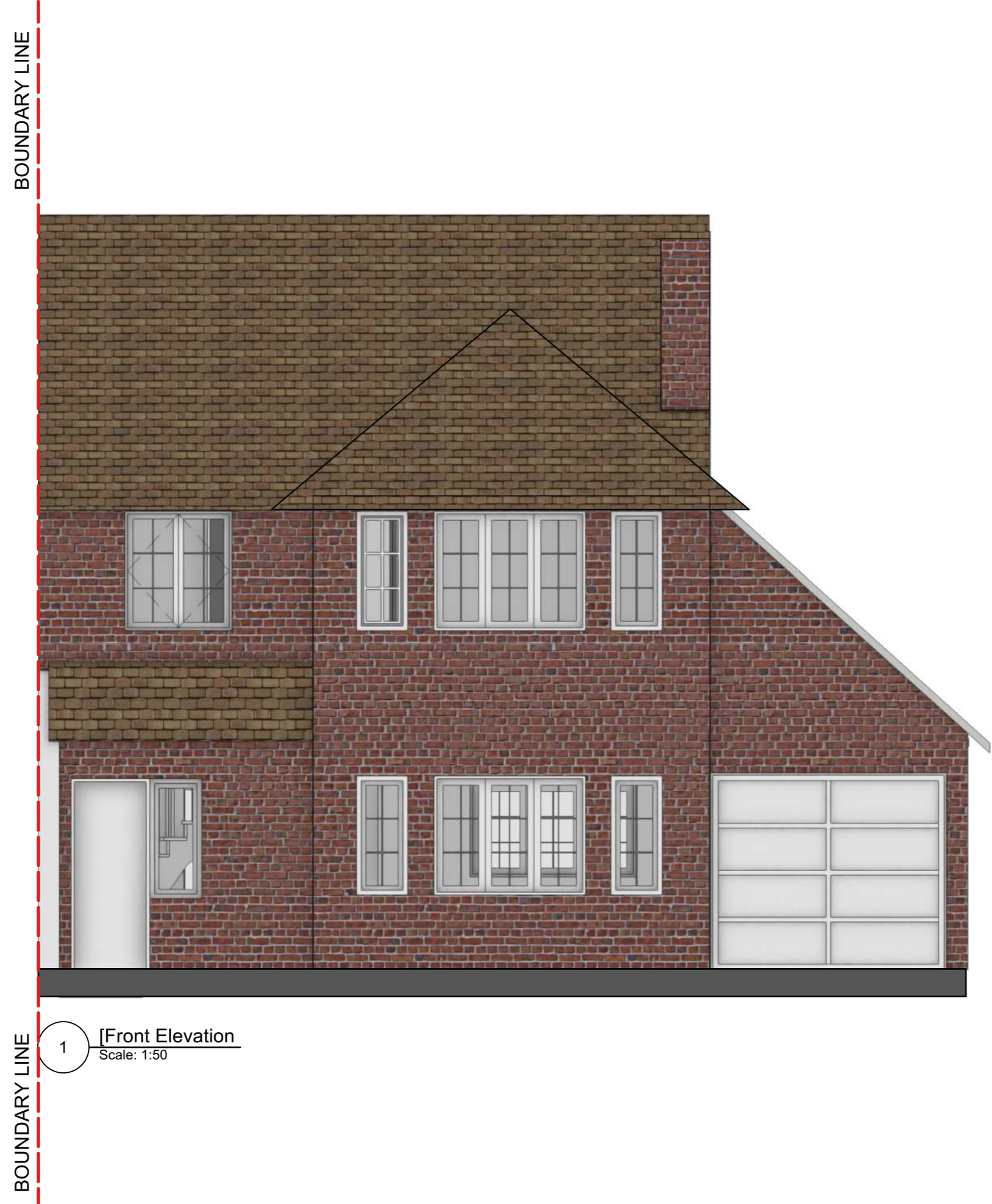
1 Front Elevation Scale: 1:50