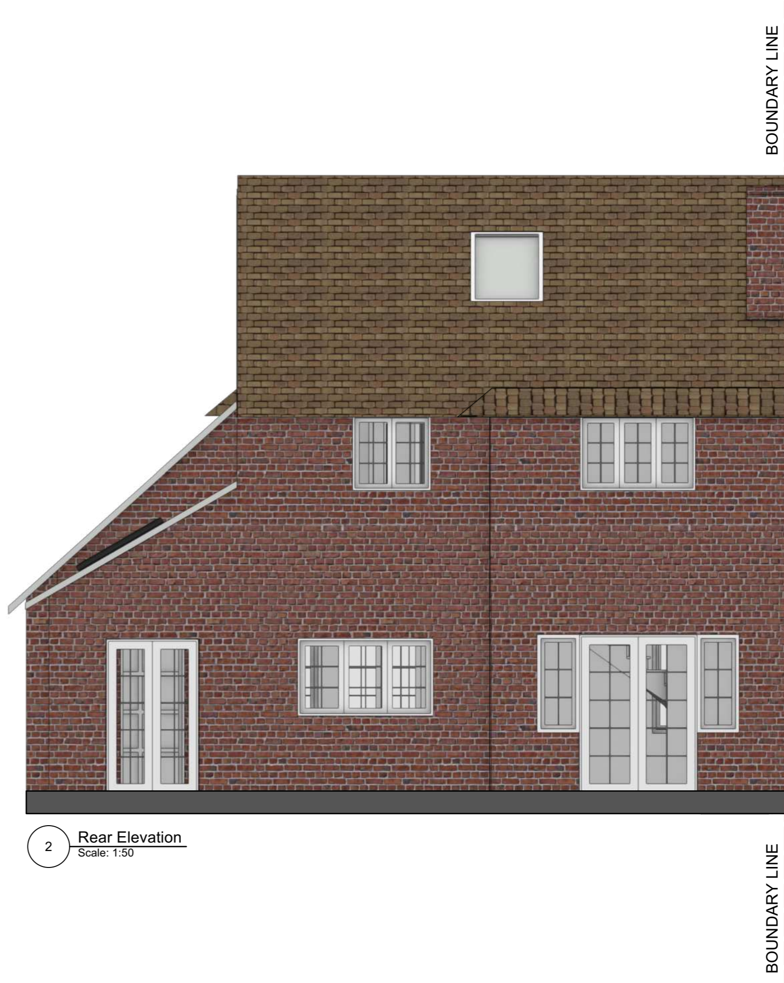
2 Rear Elevation Scale: 1:50