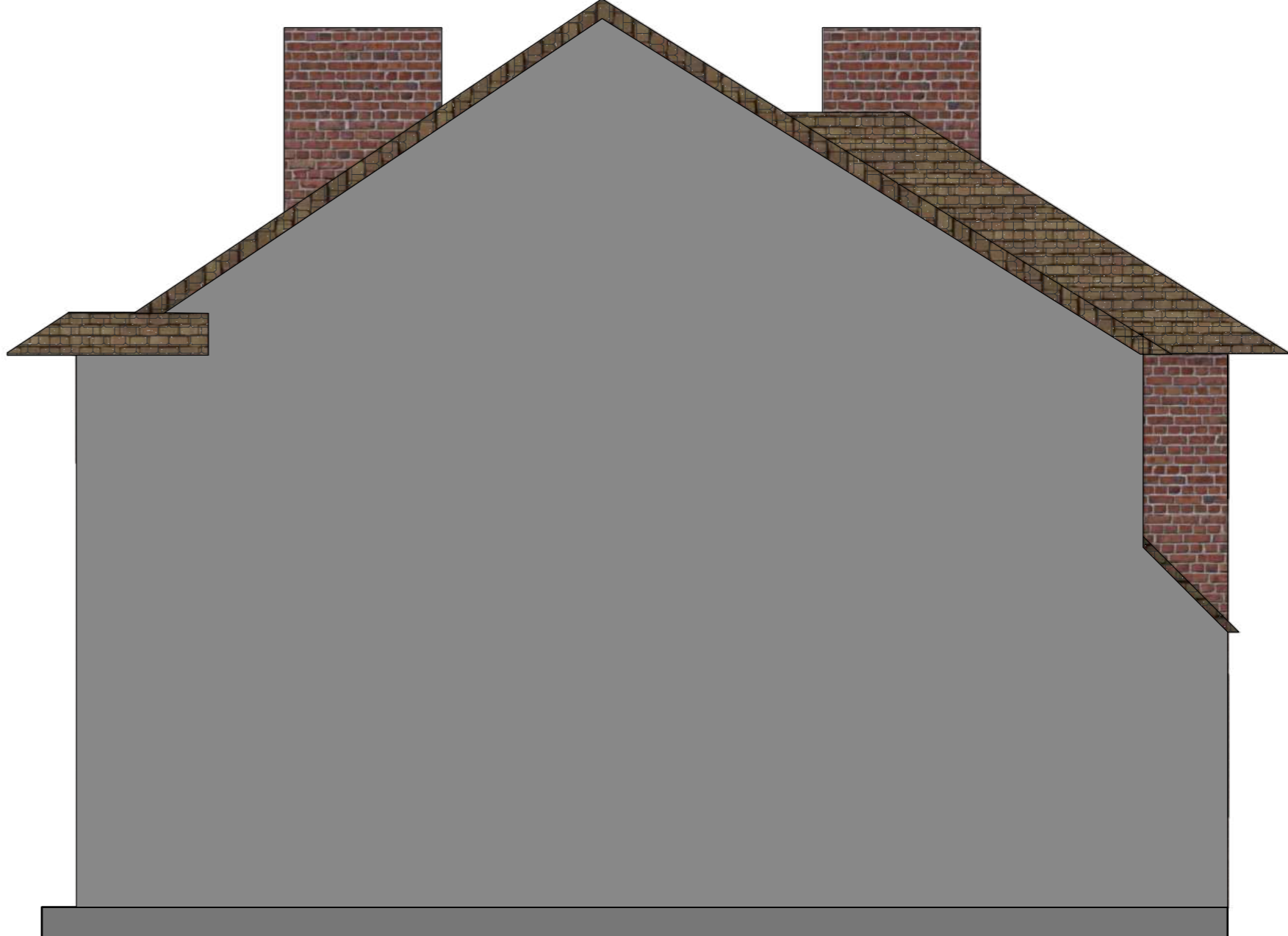
4 Left Elevation Scale: 1:50