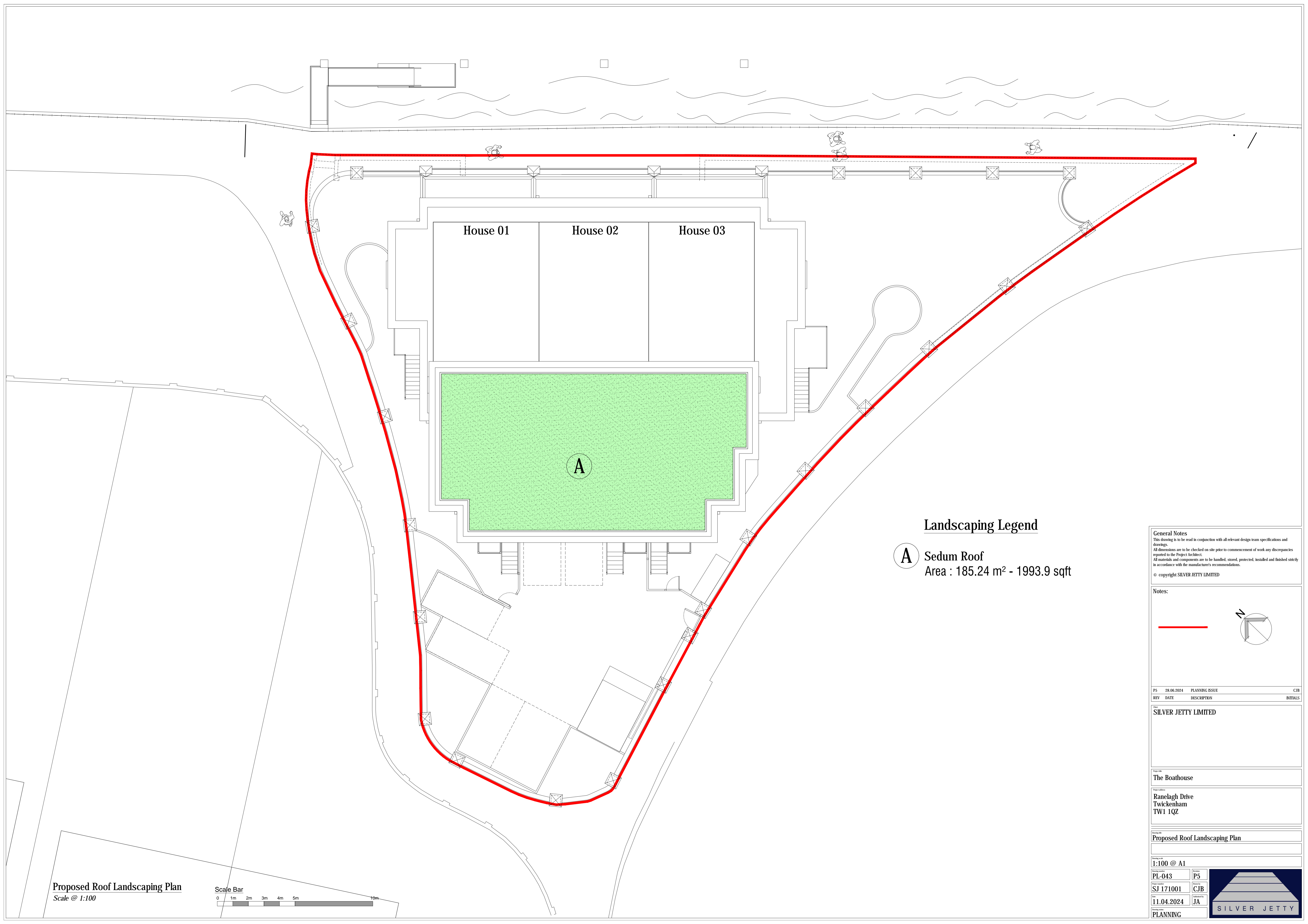
Proposed Roof Landscaping Plan Scale @ 1:100