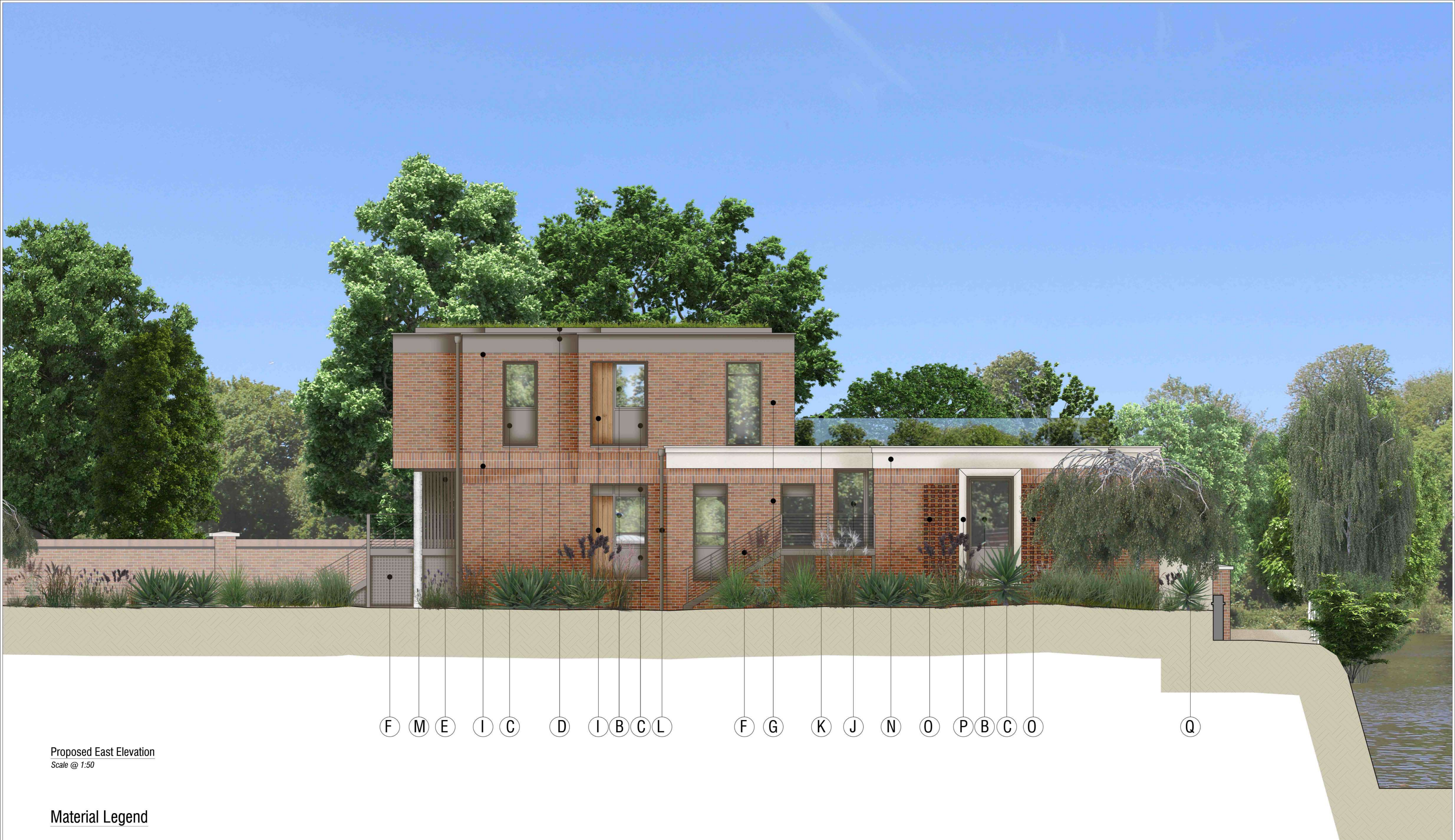
Proposed East Elevation Scale @ 1:50