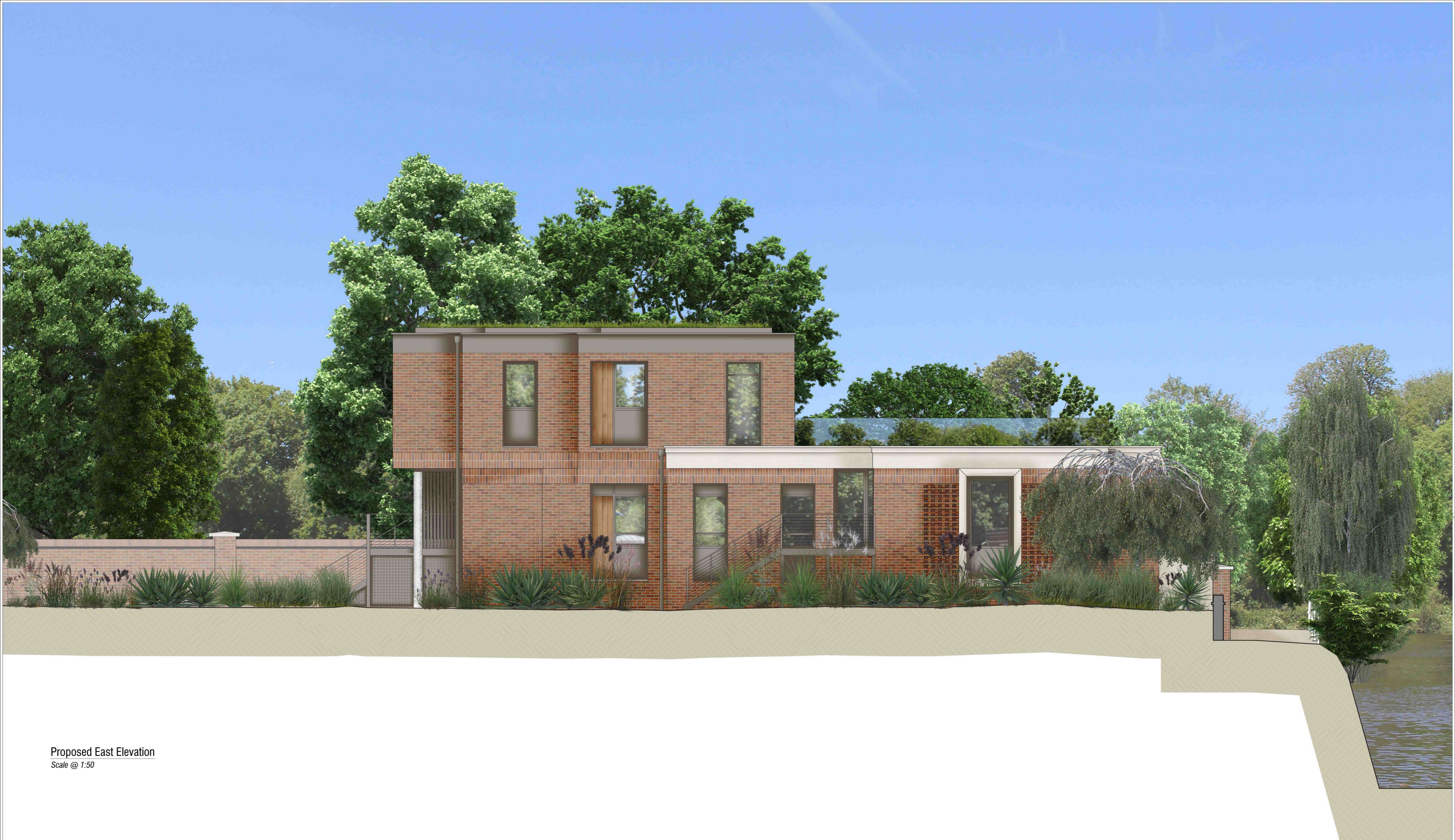
Proposed East Elevation Scale @ 1:50