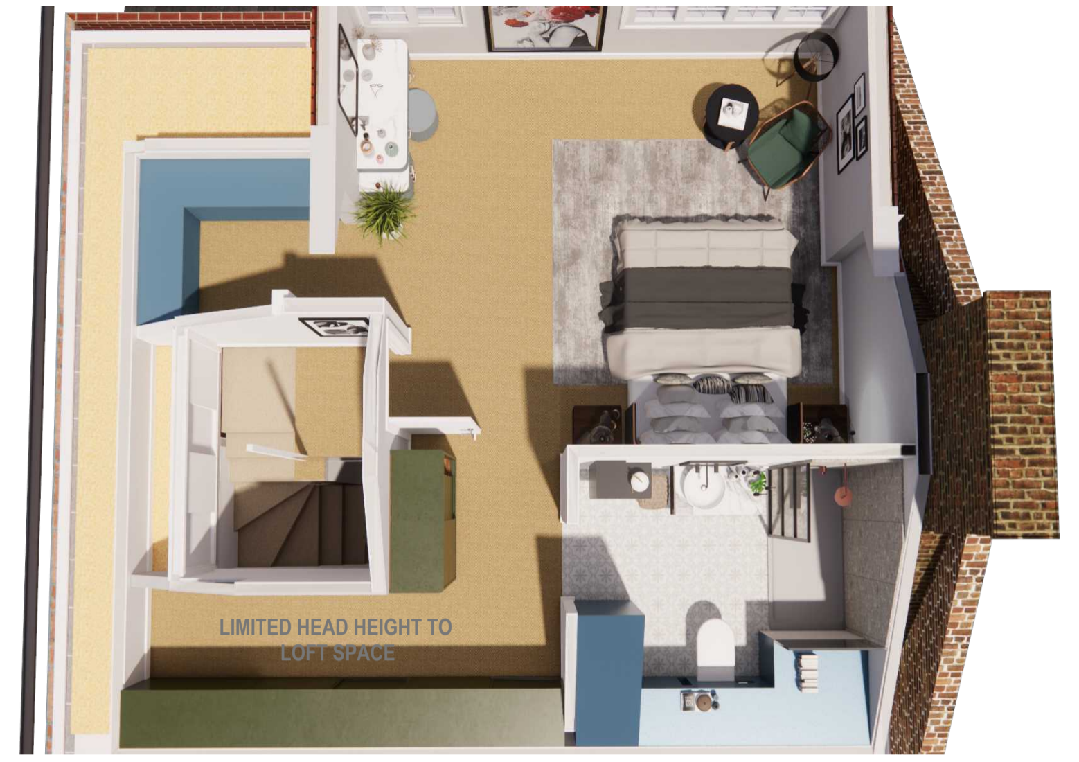
A 01 PROPOSED VIEW scale: