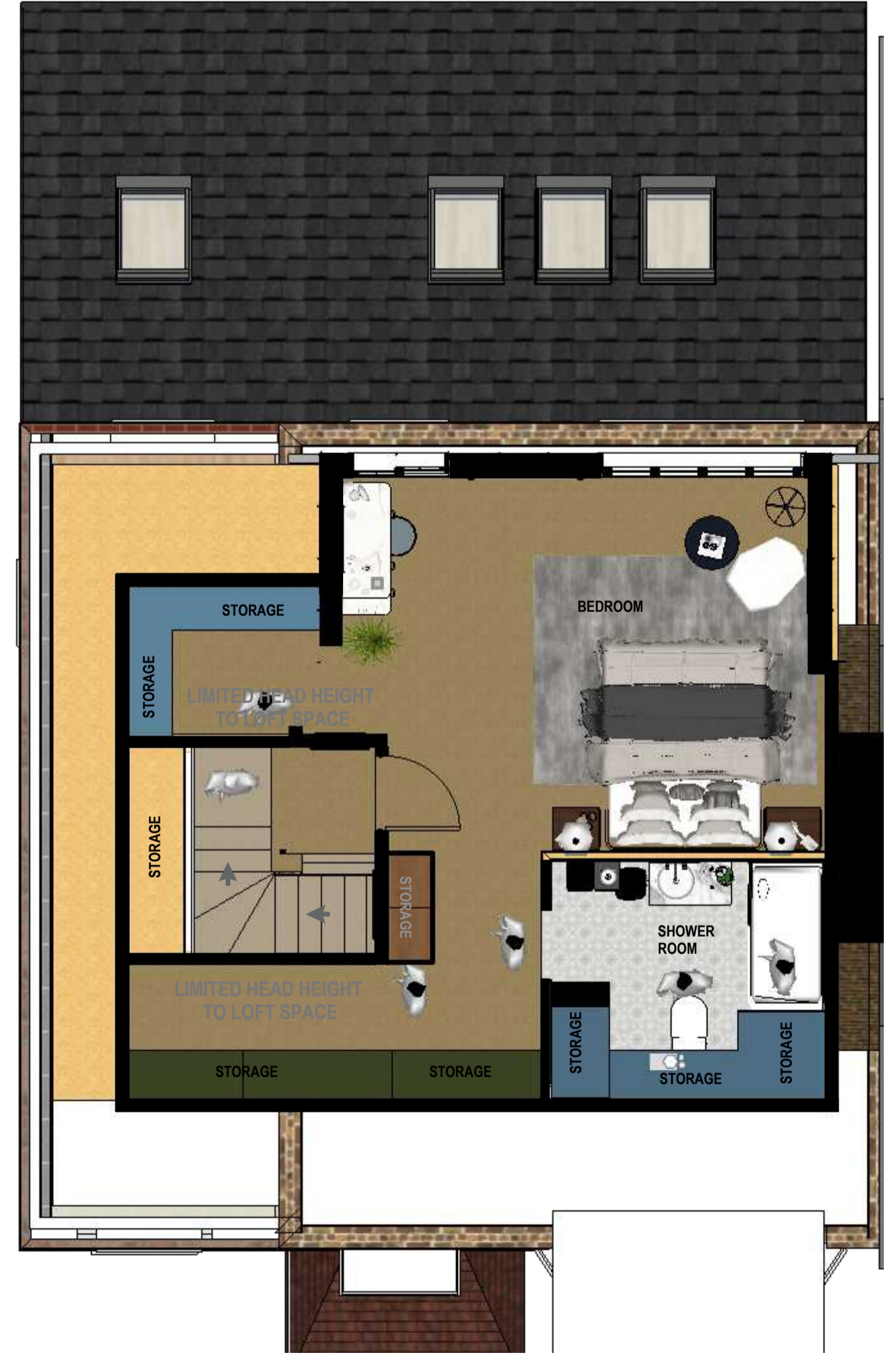
A 01 PROPOSED SECOND FLOOR PLAN scale: 1:50