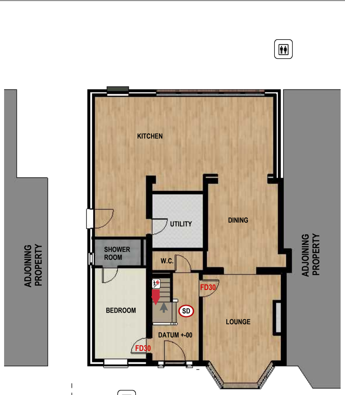
A 01 PROPOSED GROUND FLOOR PLAN scale: 1:100