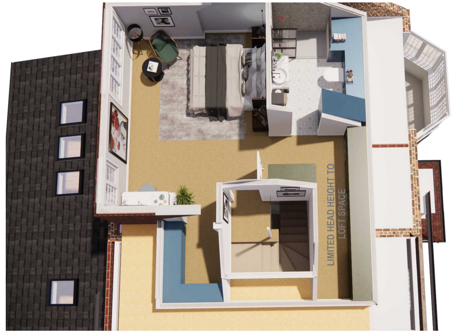
A 01 PROPOSED VIEW scale: