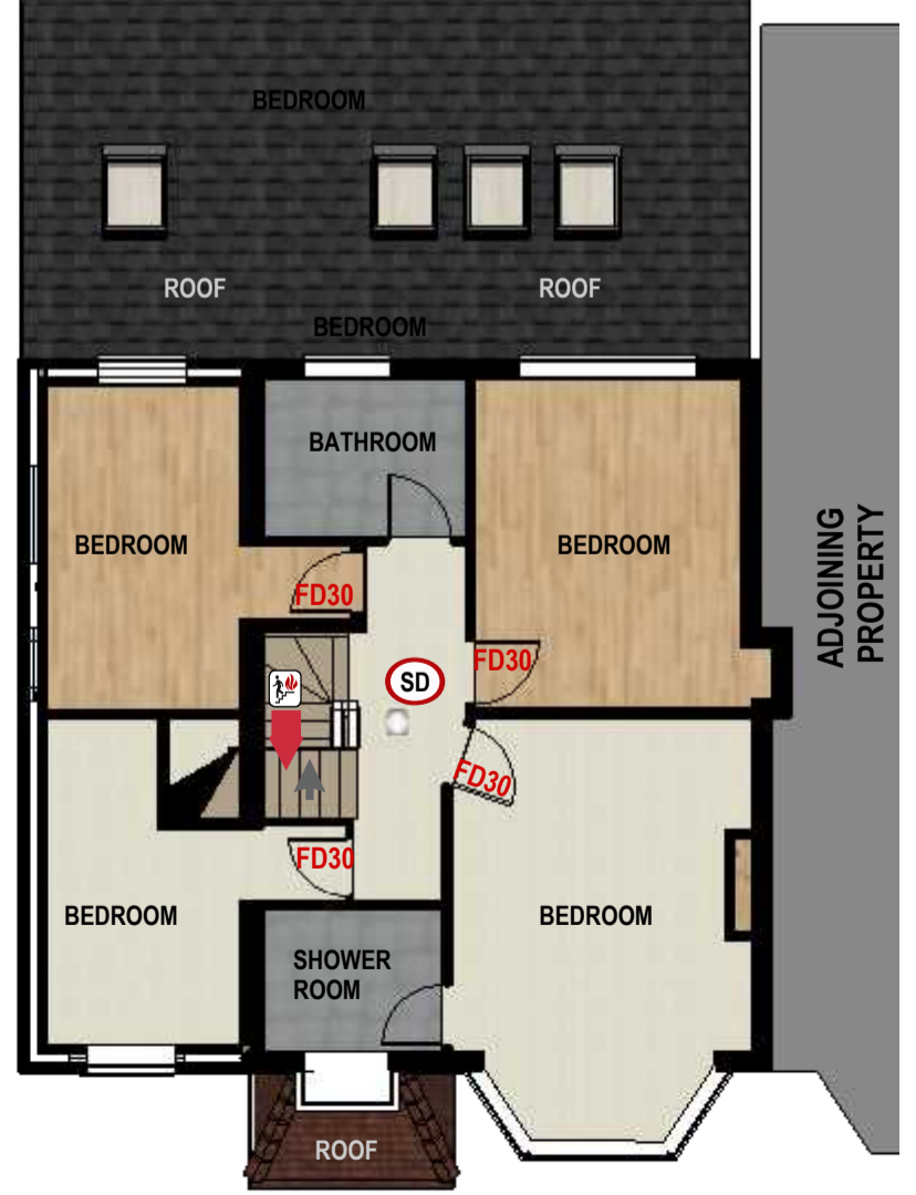
A 01 PROPOSED FIRST FLOOR PLAN scale: 1:100