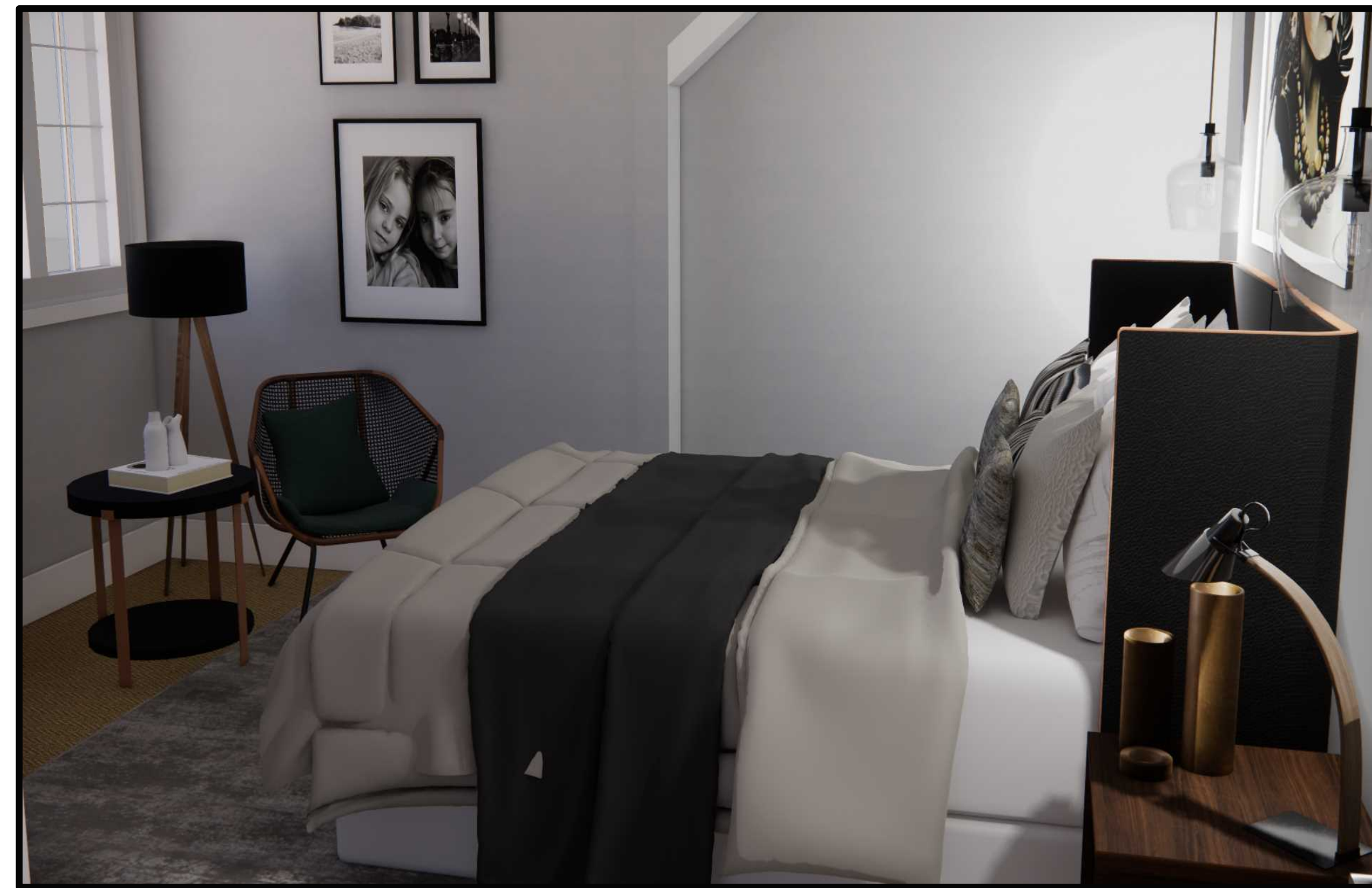
A 01 PROPOSED VIEW scale: