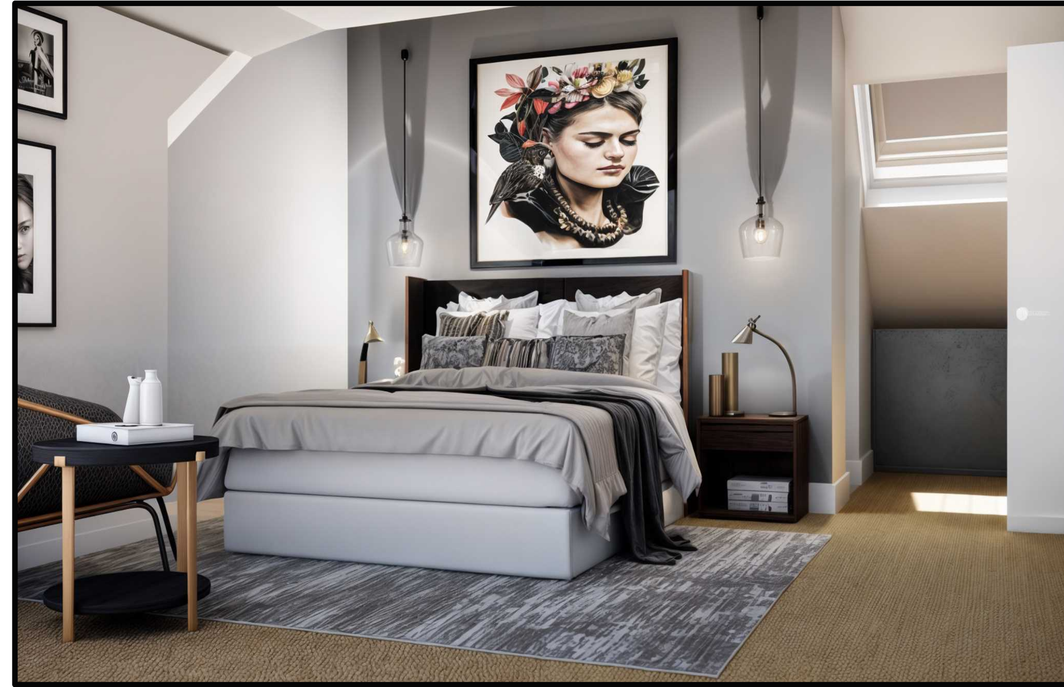
A 01 PROPOSED VIEW scale: