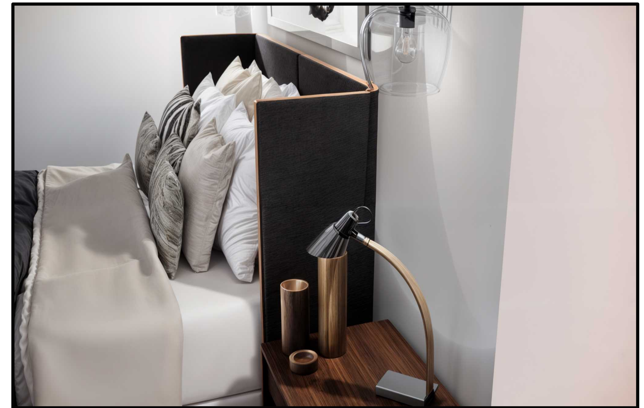
A 01 PROPOSED VIEW scale: