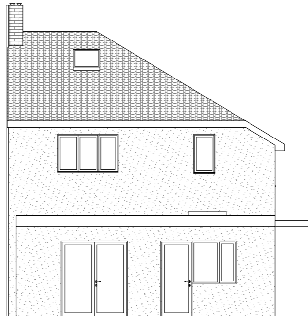
Existing Rear Elevation 1:100