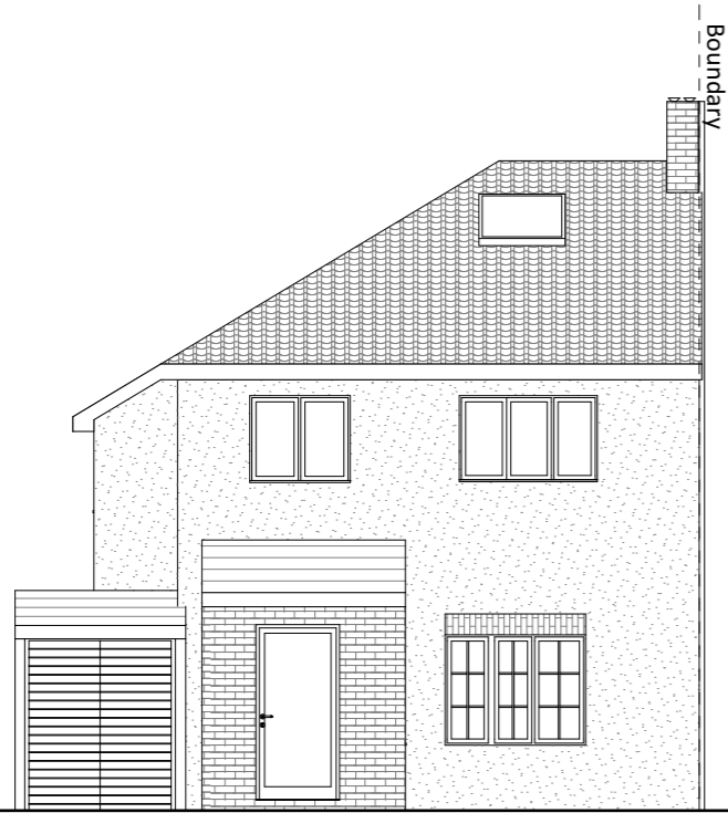
Existing Front Elevation 1:100