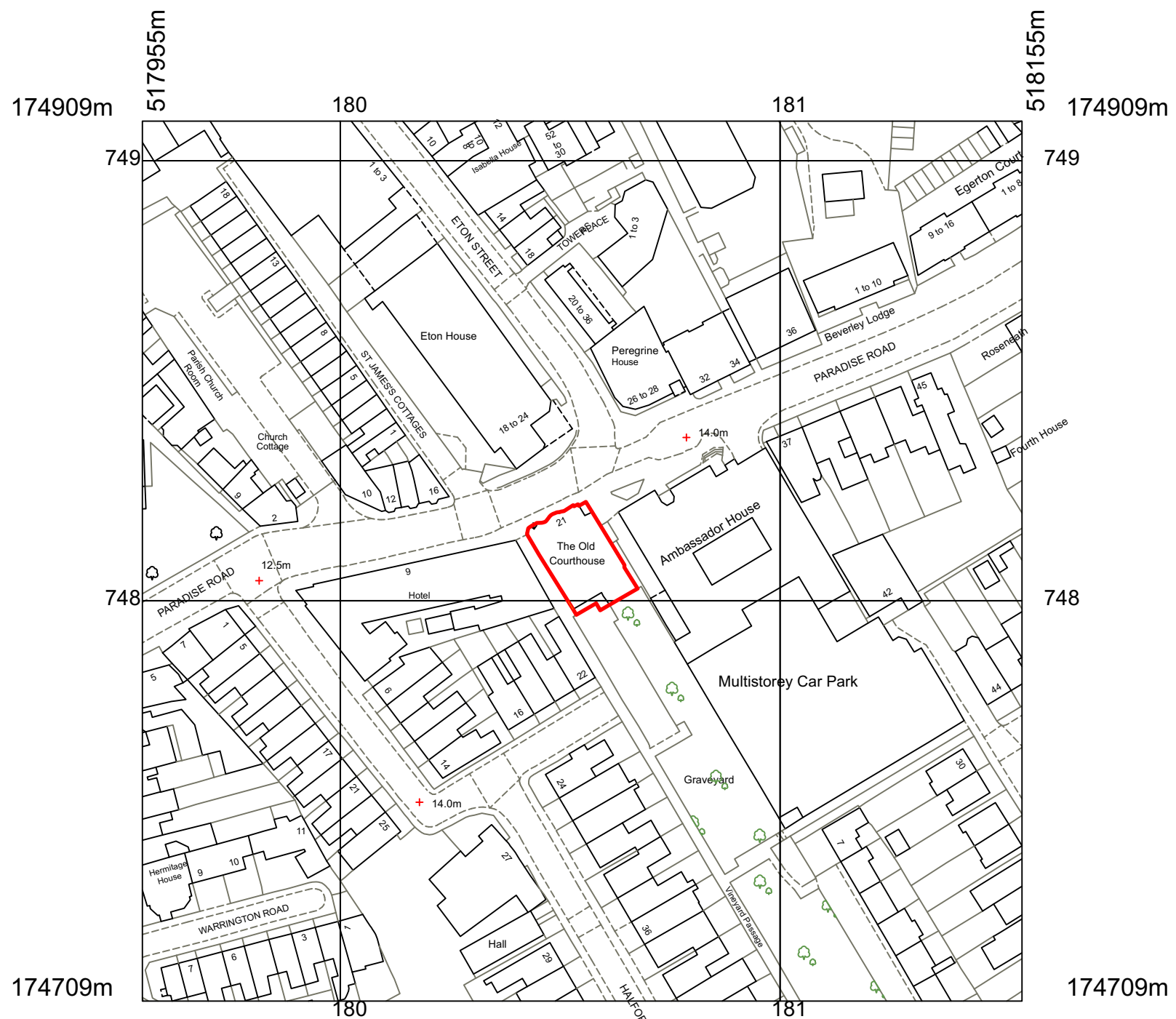
1 LOCATION PLAN Scale 1:1250@A3