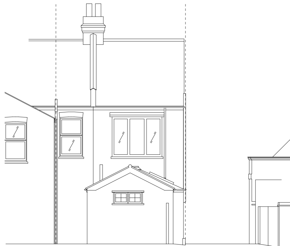
3 Rear Elevation 1:100