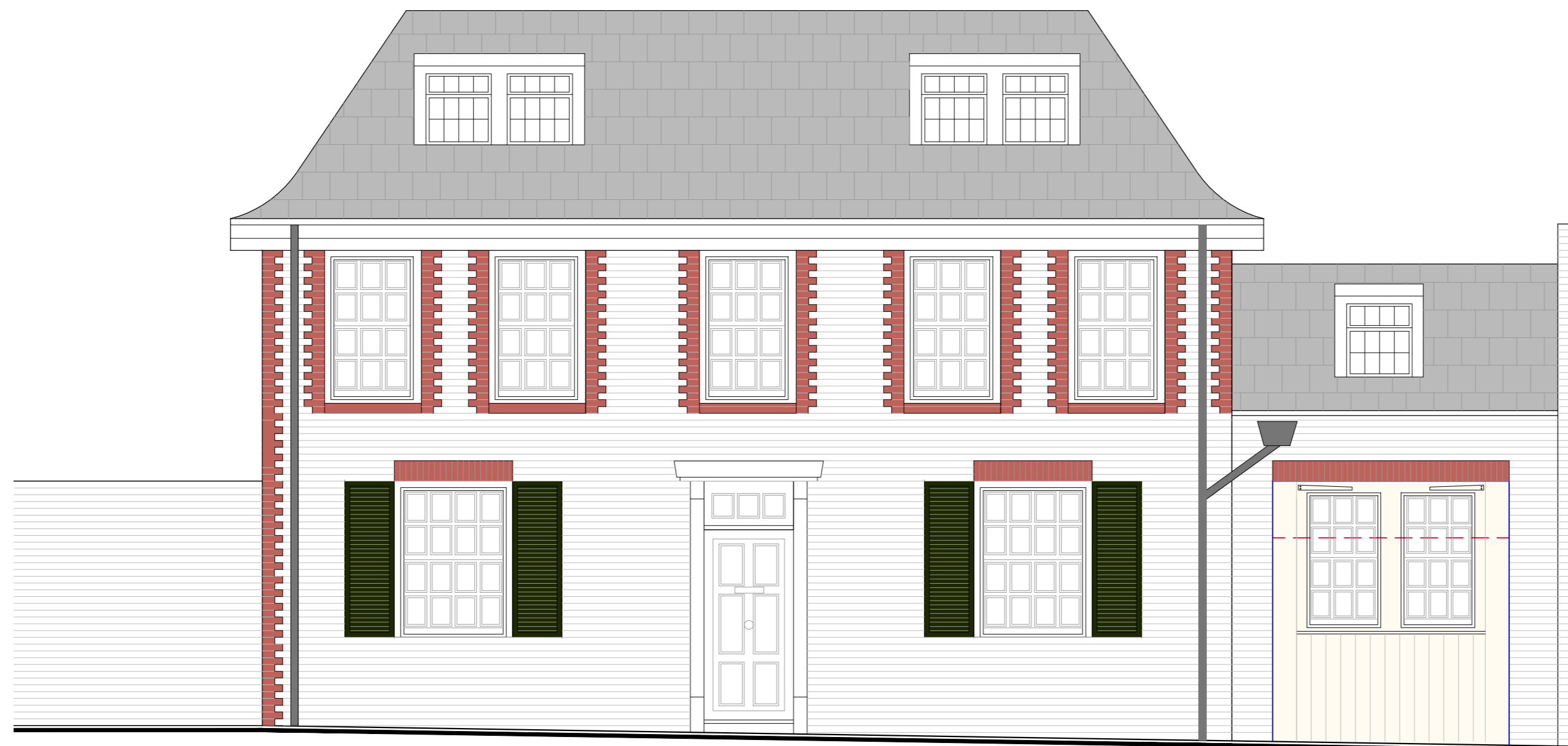
2 Proposed FRONT Elevation 1:50 @ A2