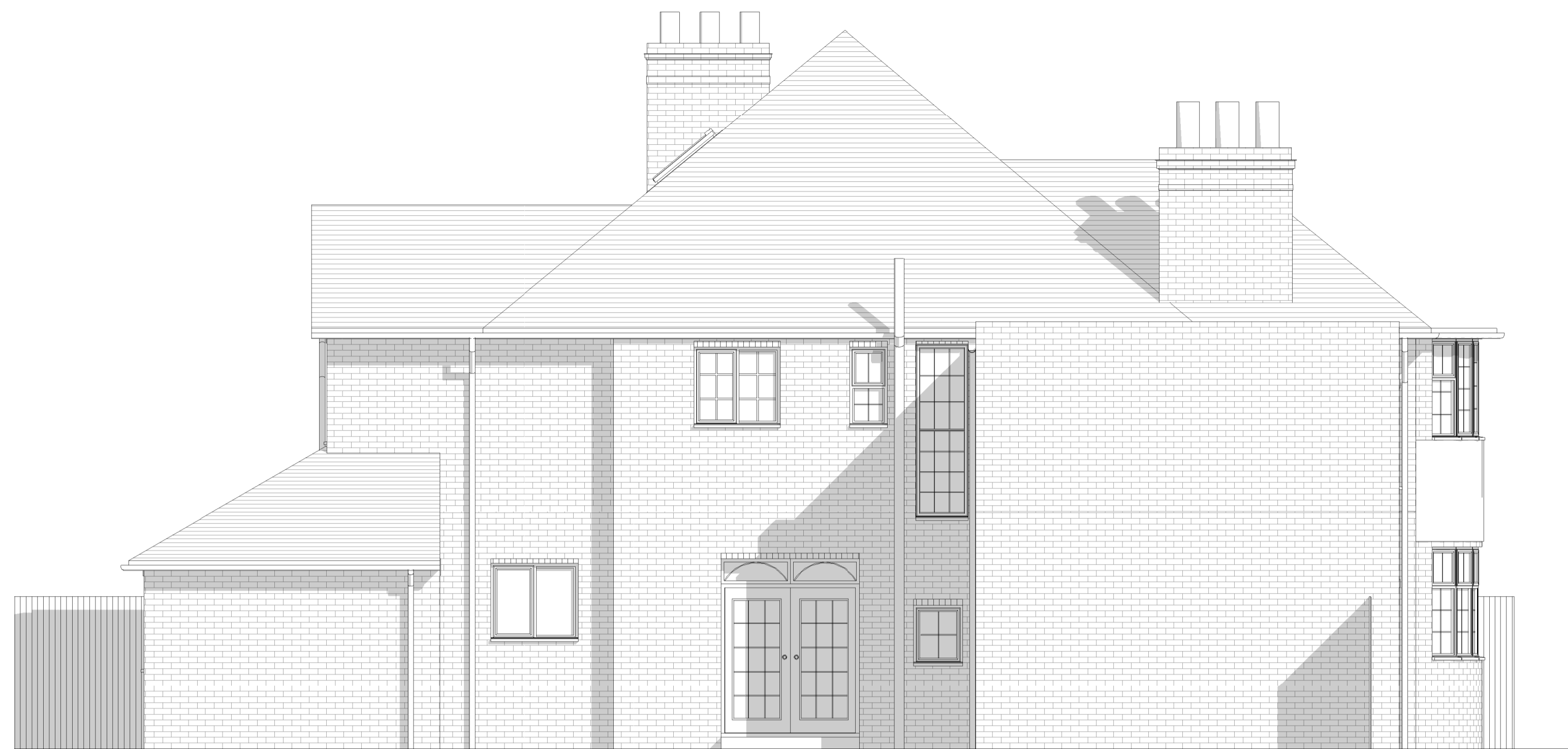
3 Existing South Elevation 1 : 50