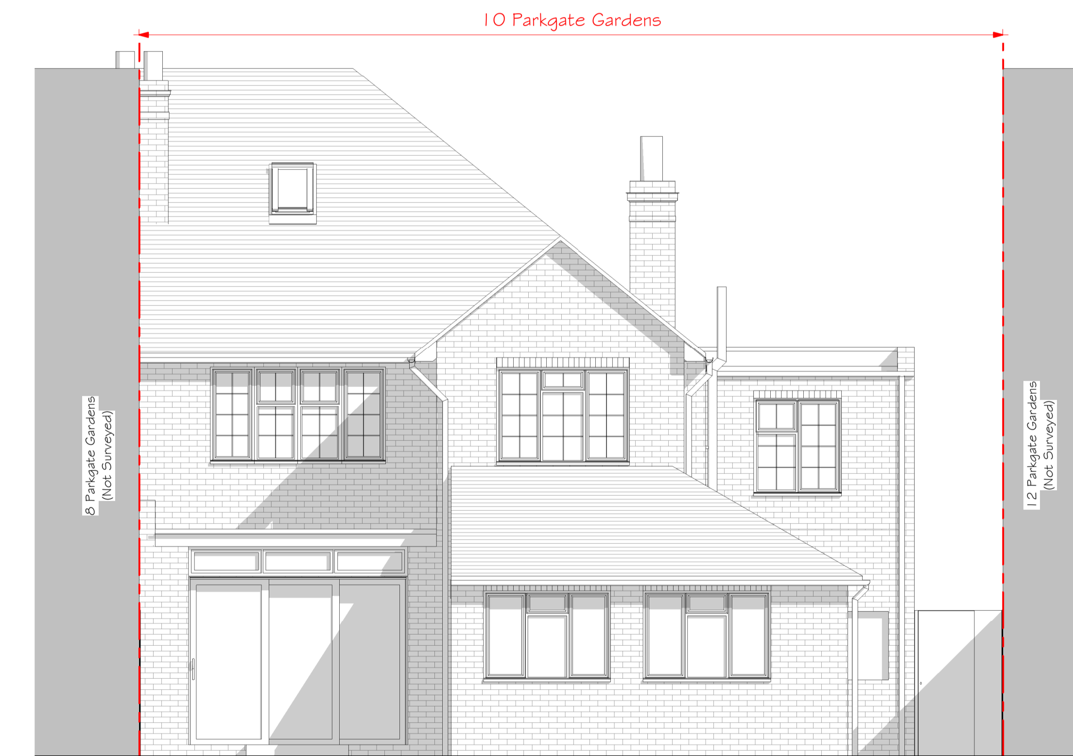
4 Existing Rear(West) Elevation 1 : 50

This drawing is expressly for the purpose of use as part of the Planning application for this scheme and should not be used for construction.