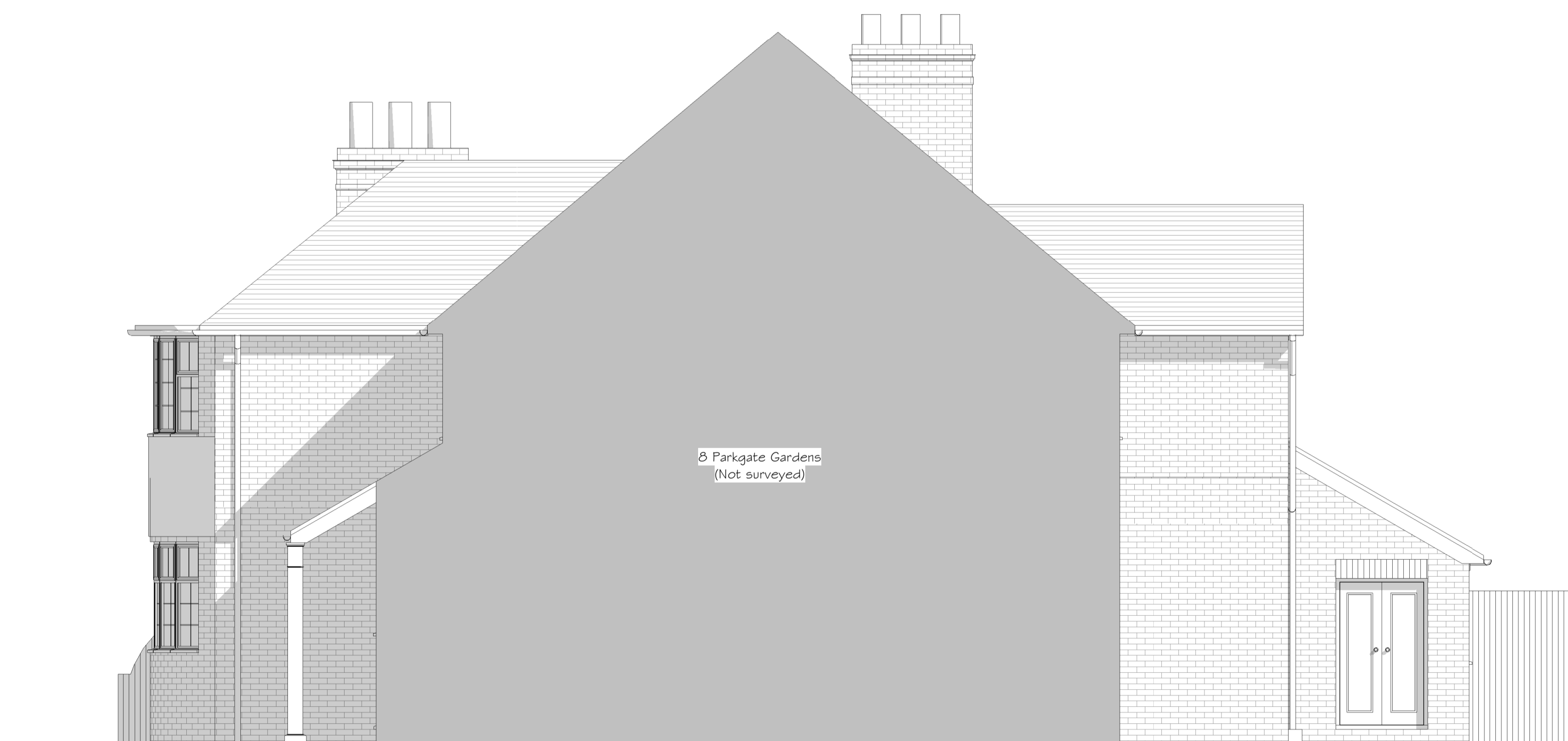
2 Existing North Elevation 1 : 50