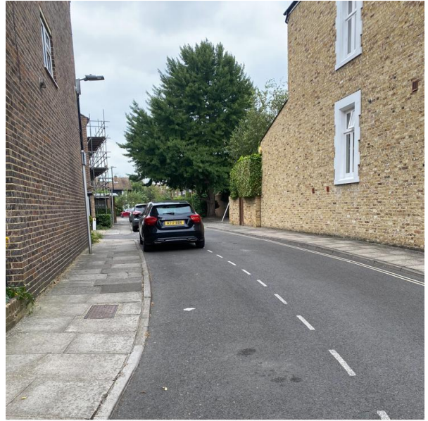
Add a Caption