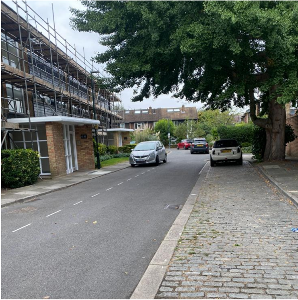
Add a Caption