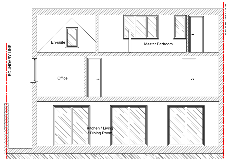
PROPOSED SECTION B-B'