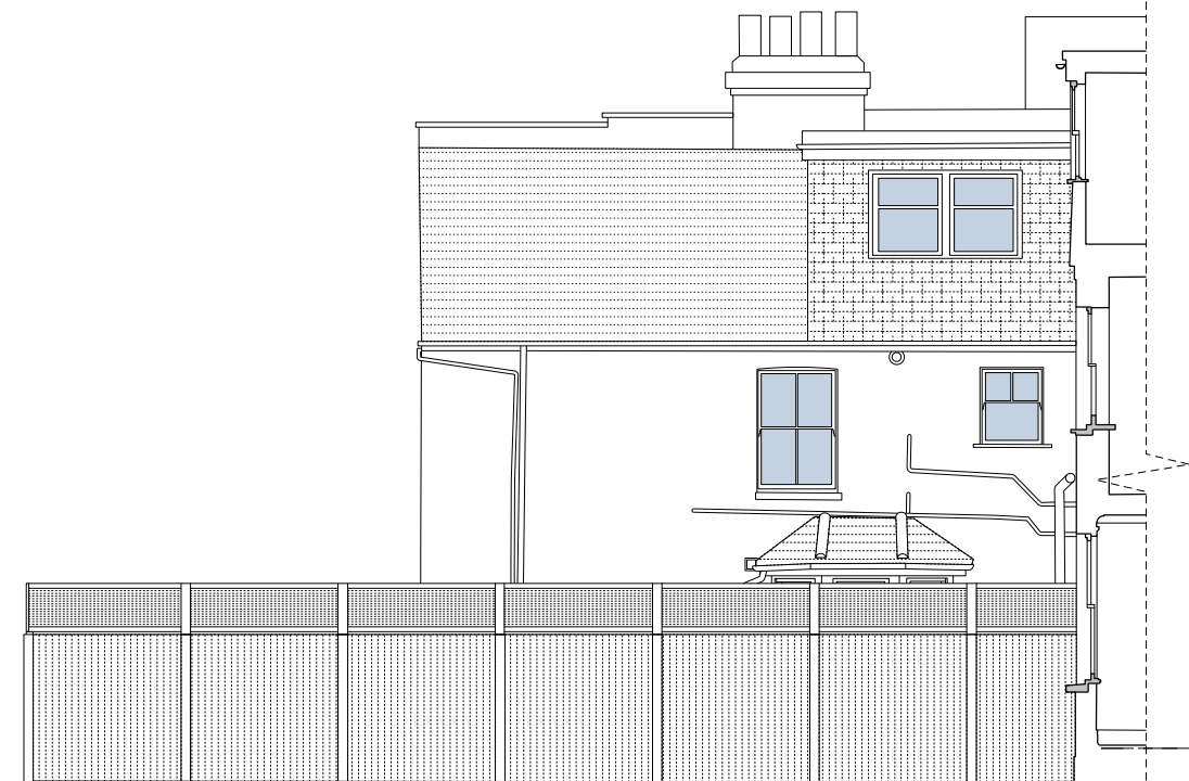
SIDE ELEVATION as seen from neighbour at 6 White Hart Lane