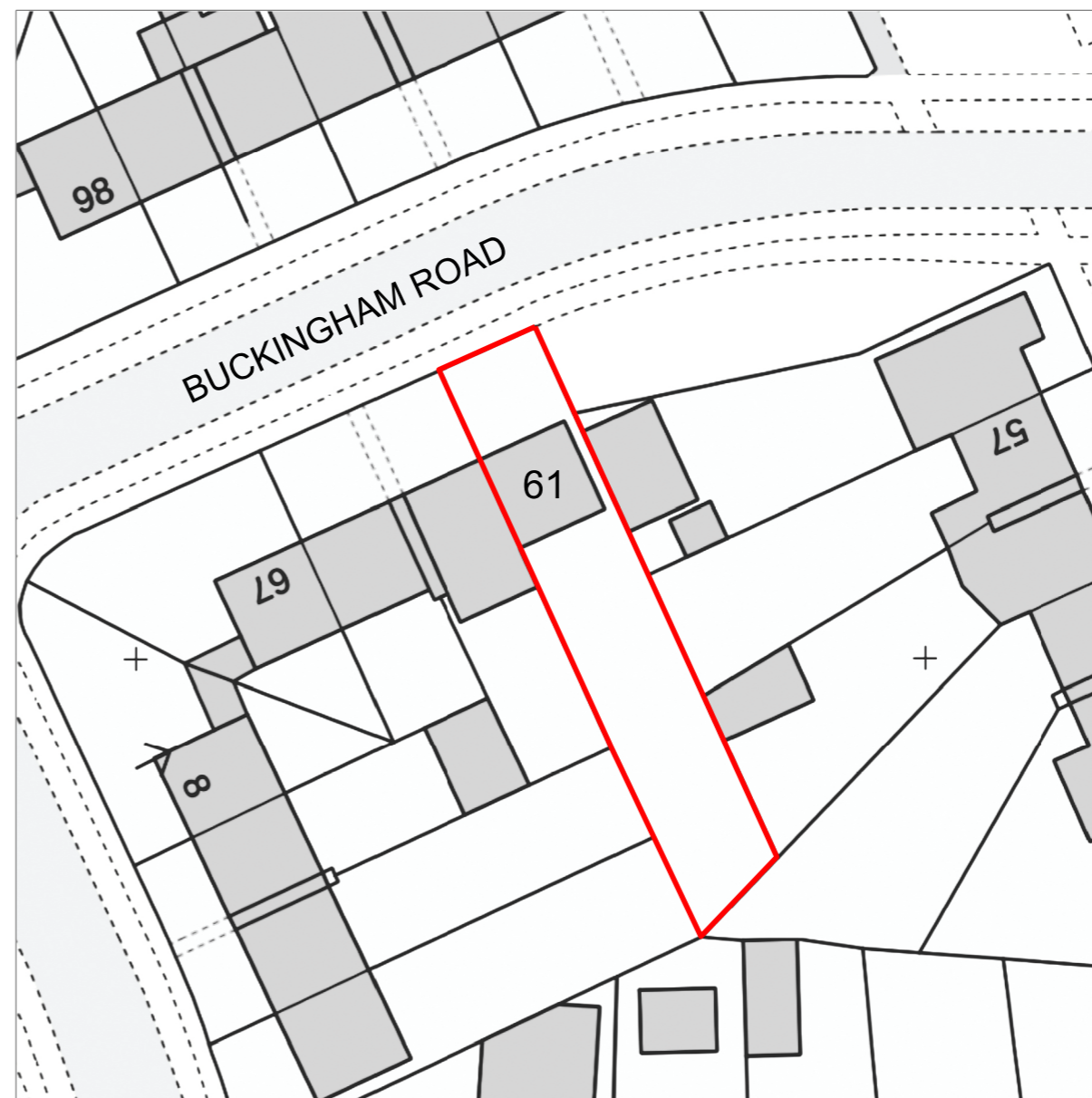
02 LOCATION PLAN SCALE 1:500