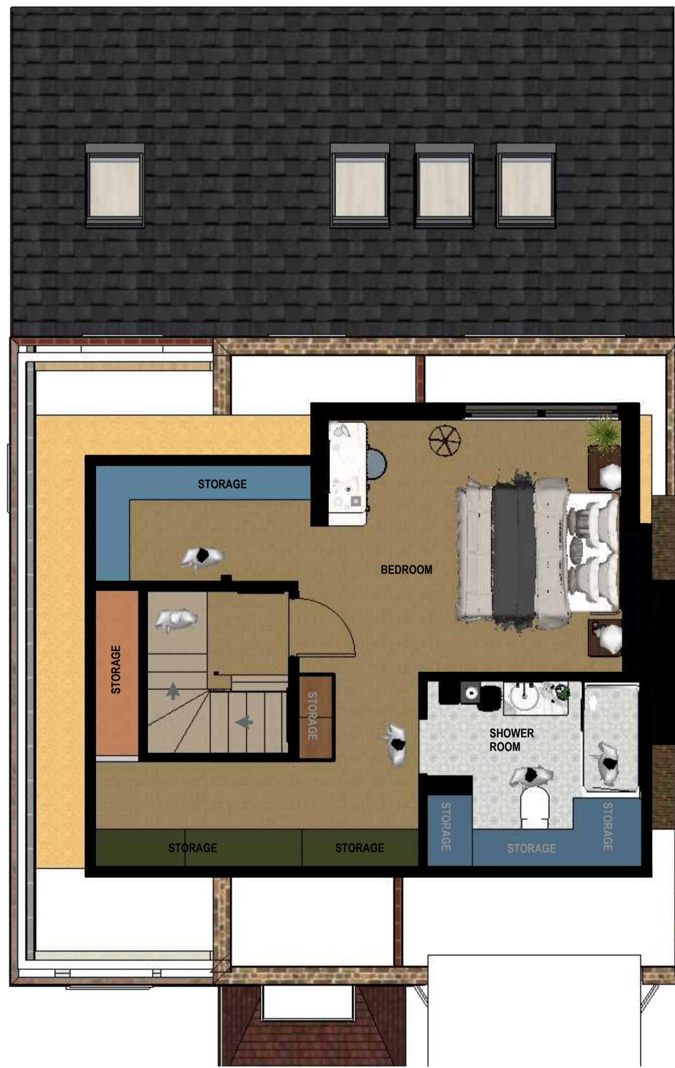
A 01 PROPOSED SECOND FLOOR PLAN scale: 1:50