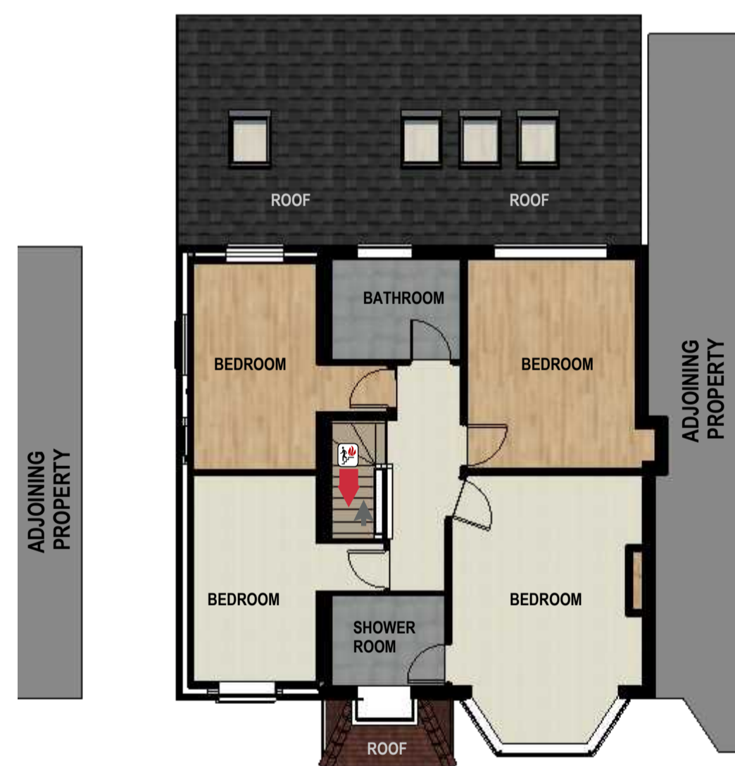
A 01 EXISTING FIRST FLOOR PLAN scale: 1:100