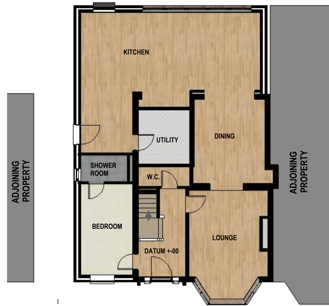
A 01 EXISTING GROUND FLOOR PLAN scale: 1:100