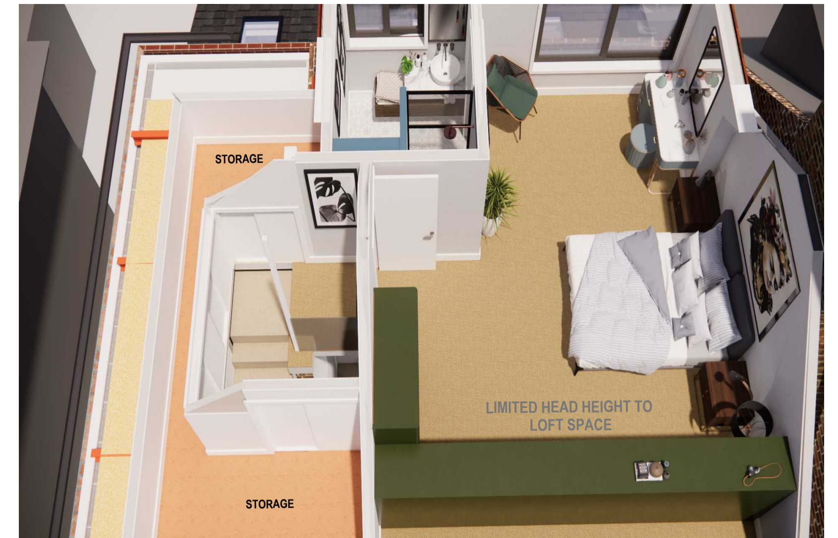
A 01 PROPOSED VIEW scale: