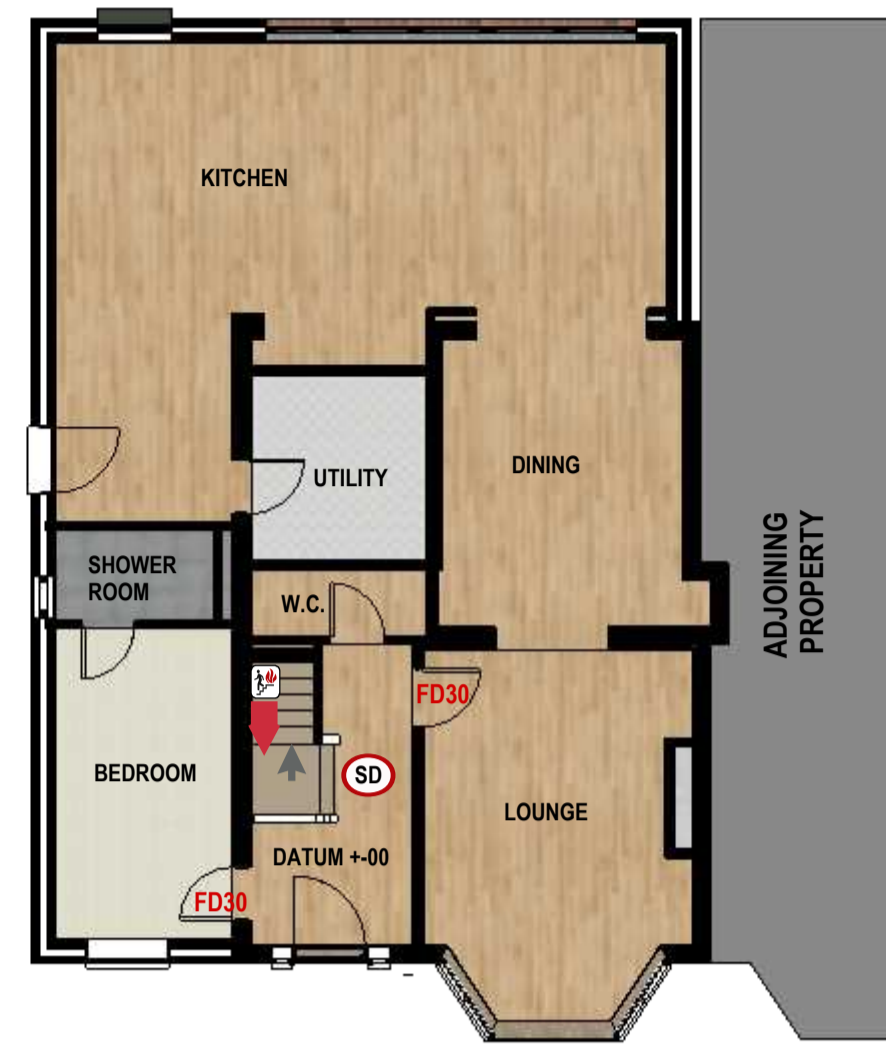
A 01 PROPOSED GROUND FLOOR PLAN scale: 1:100