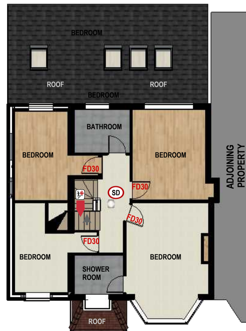
A 01 PROPOSED FIRST FLOOR PLAN scale: 1:100