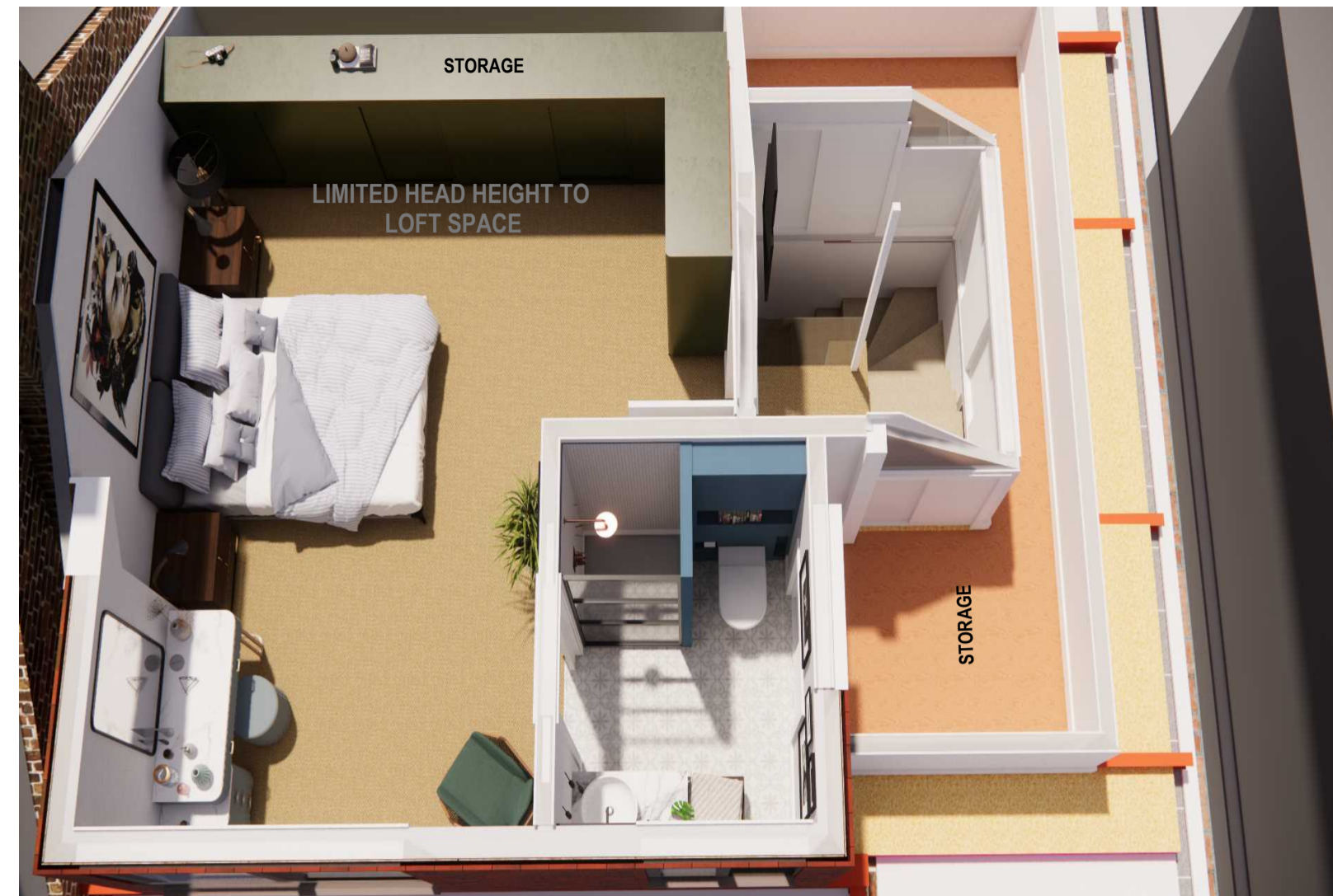
A 01 PROPOSED VIEW scale: