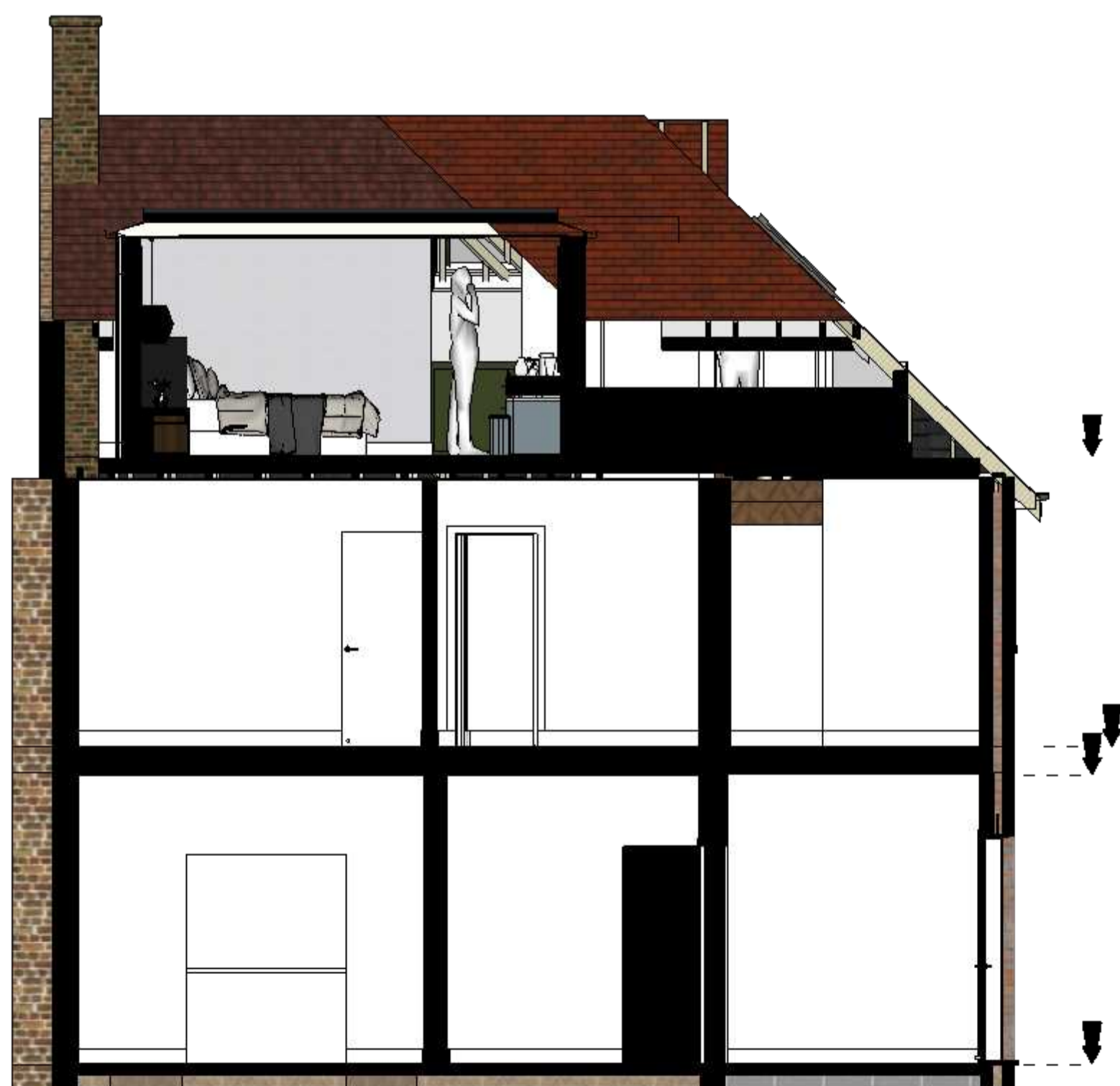
A 01 PROPOSED SECTION C-C scale: 1:50