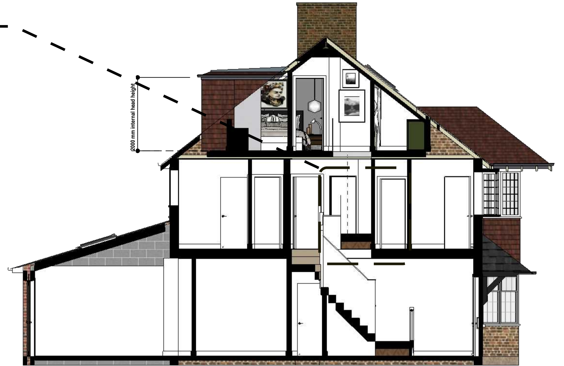
A 01 PROPOSED SECTION B-B scale: 1:50