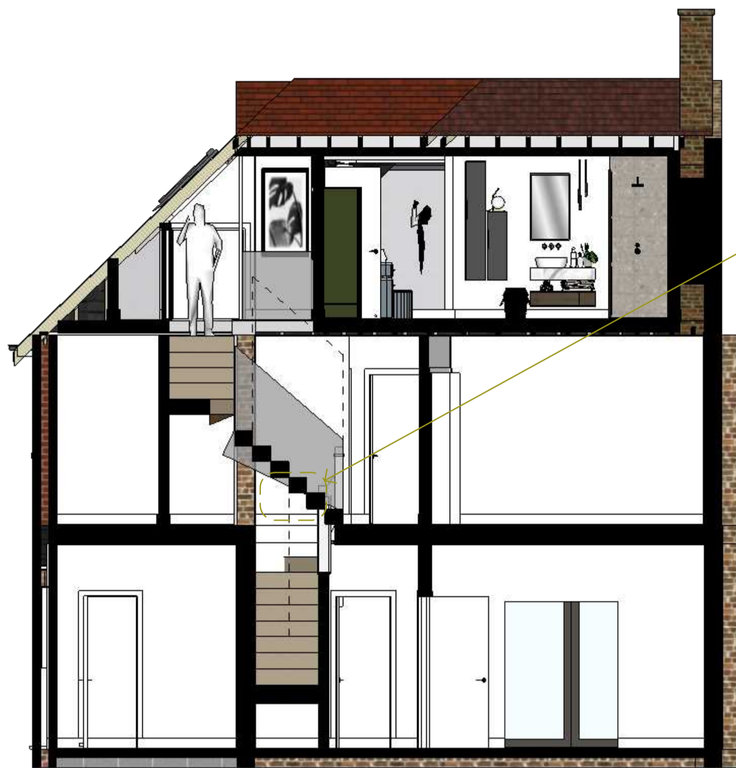
A 01 PROPOSED SECTION A-A scale: 1:50

COMMENT Limited head height to under side of stairs. Specialists staircase company to advise on optimum layout