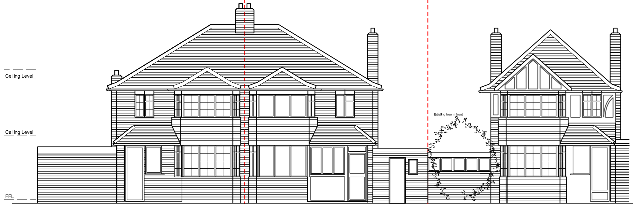
Existing Front Elevation (East)