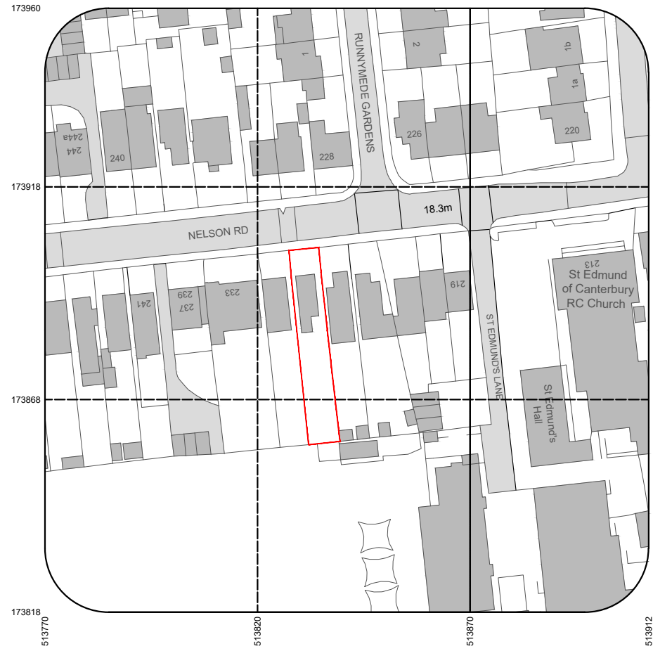
01 Existing Location Plan 000 1:1250