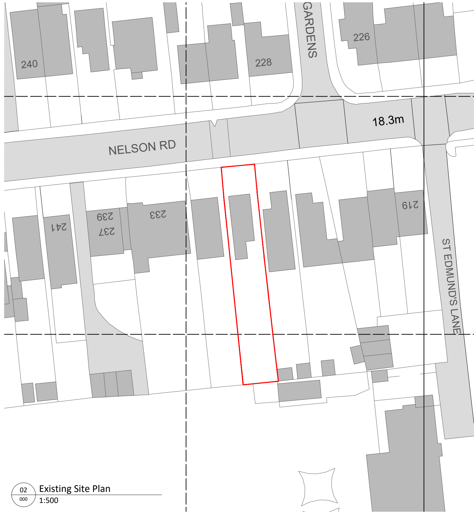
02 Existing Site Plan 000 1:500