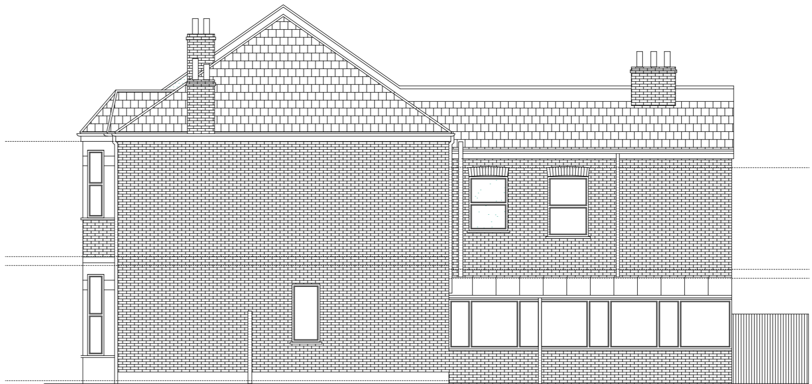
Existing Right Side Elevation