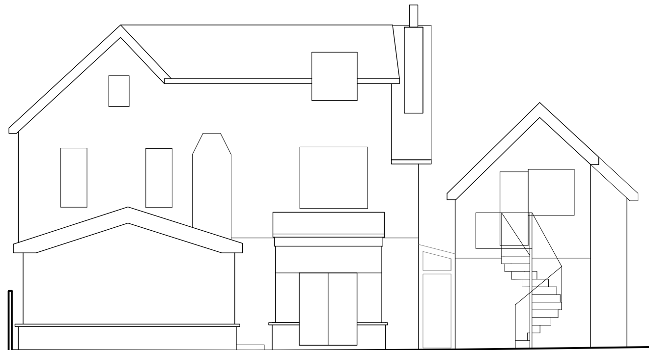
01 Existing Rear Elevation E3 1:100 @ A3