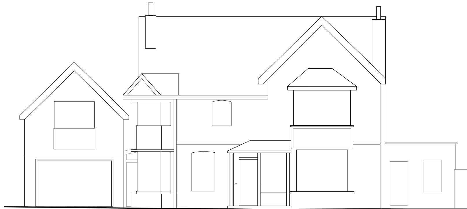
01 Existing Front Elevation E1 1:100 @ A3