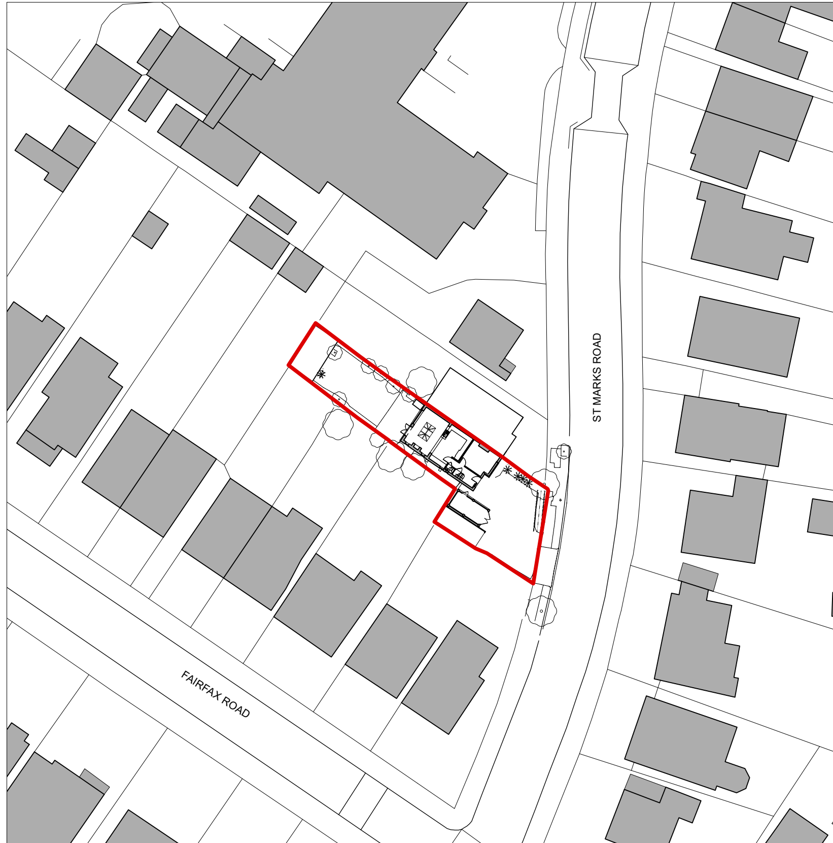
2 Proposed Block Plan Scale: 1:500