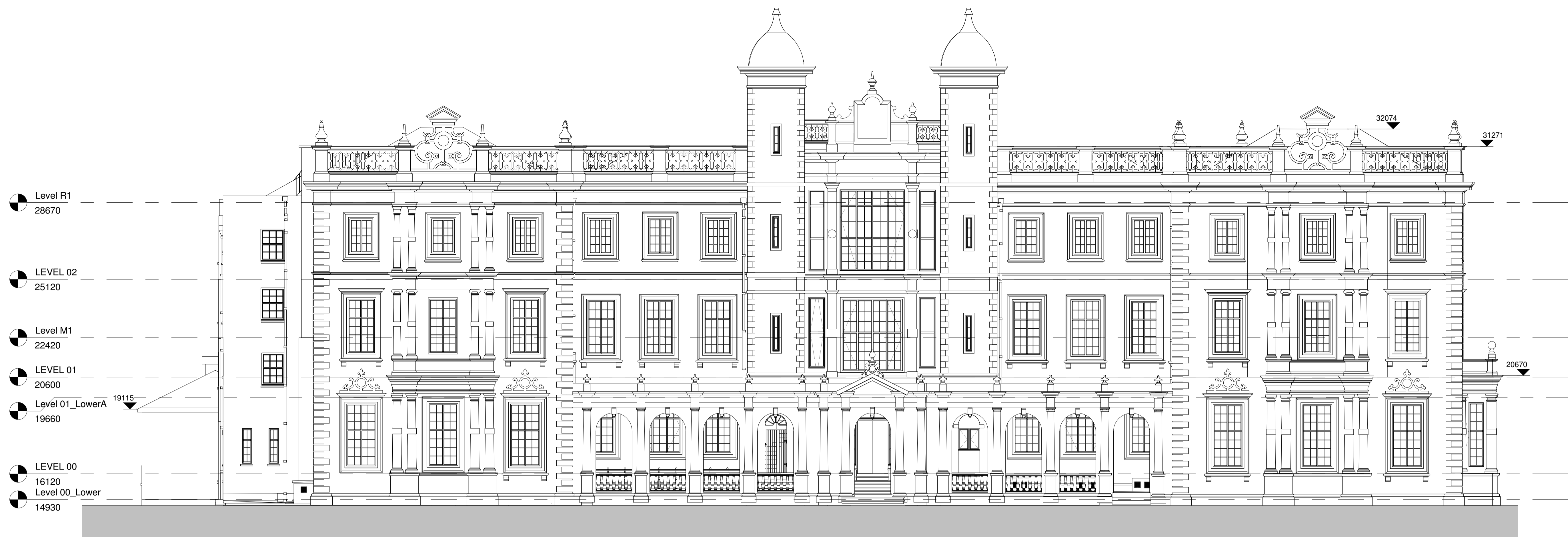
1 SOUTH ELEVATION - EXISTING 1 : 100