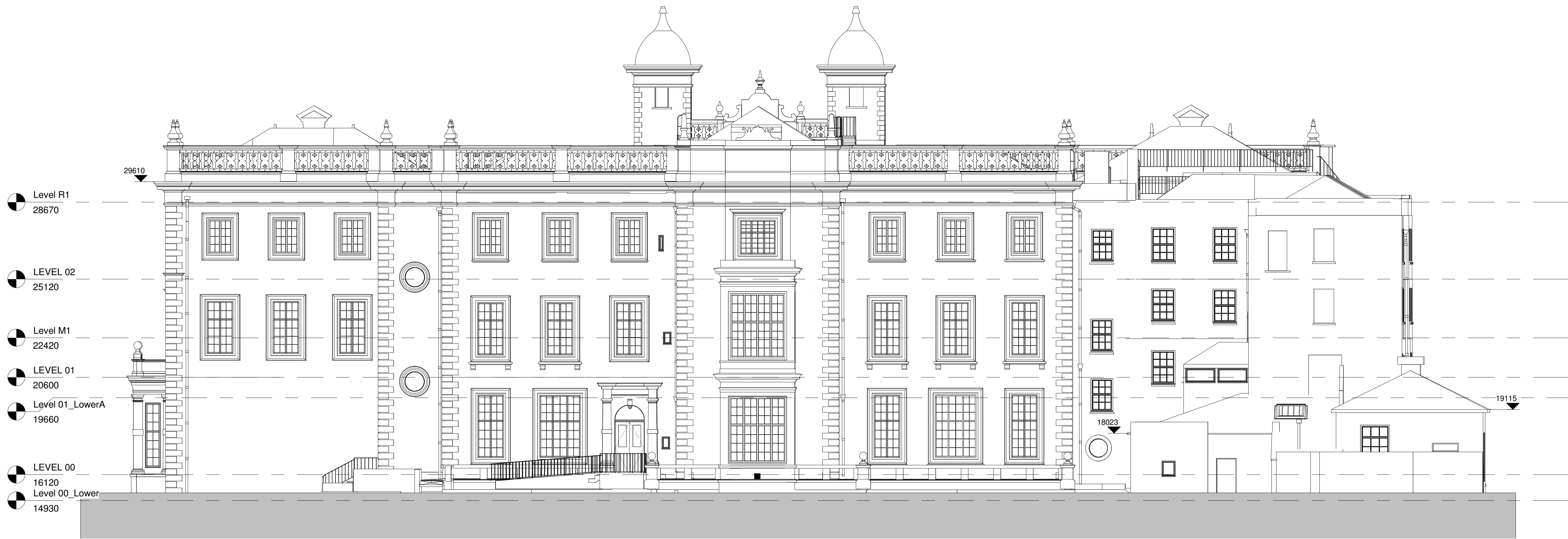
1 NORTH ELEVATION - EXISTING 1 : 100