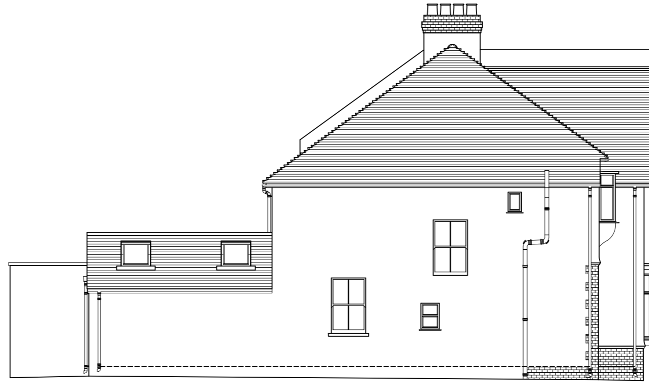
EXISTING LEFT SIDE ELEVATION