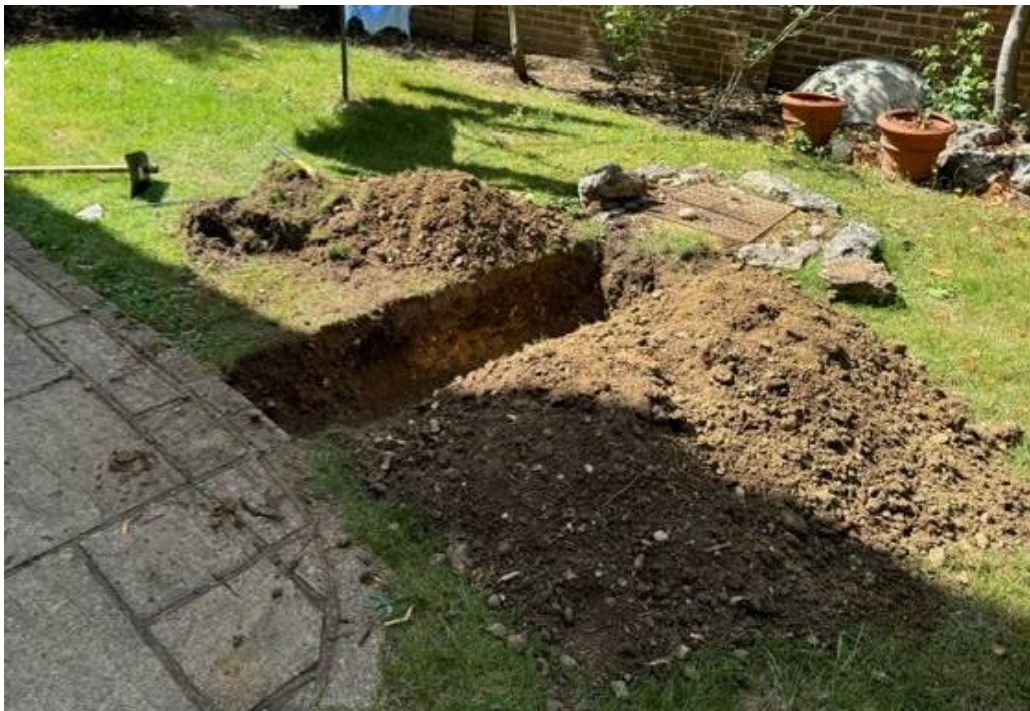
2/ The Trench Viewed from the North.