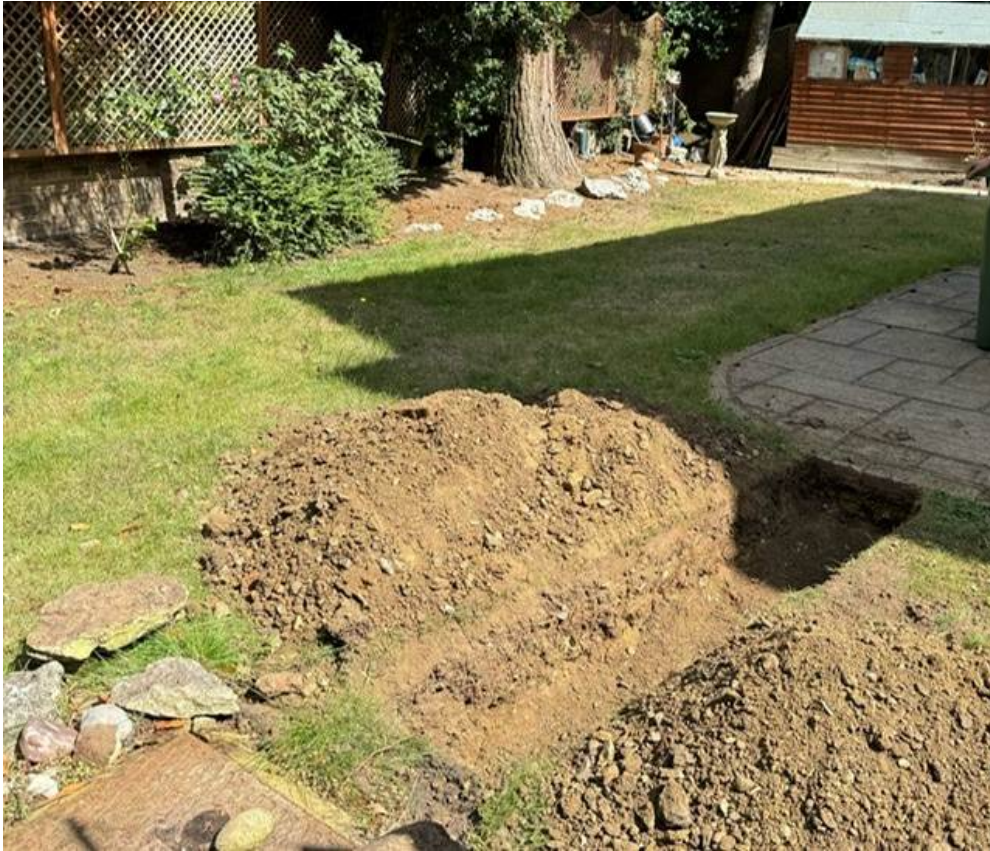
1/ The Trench Viewed from the Southwest.