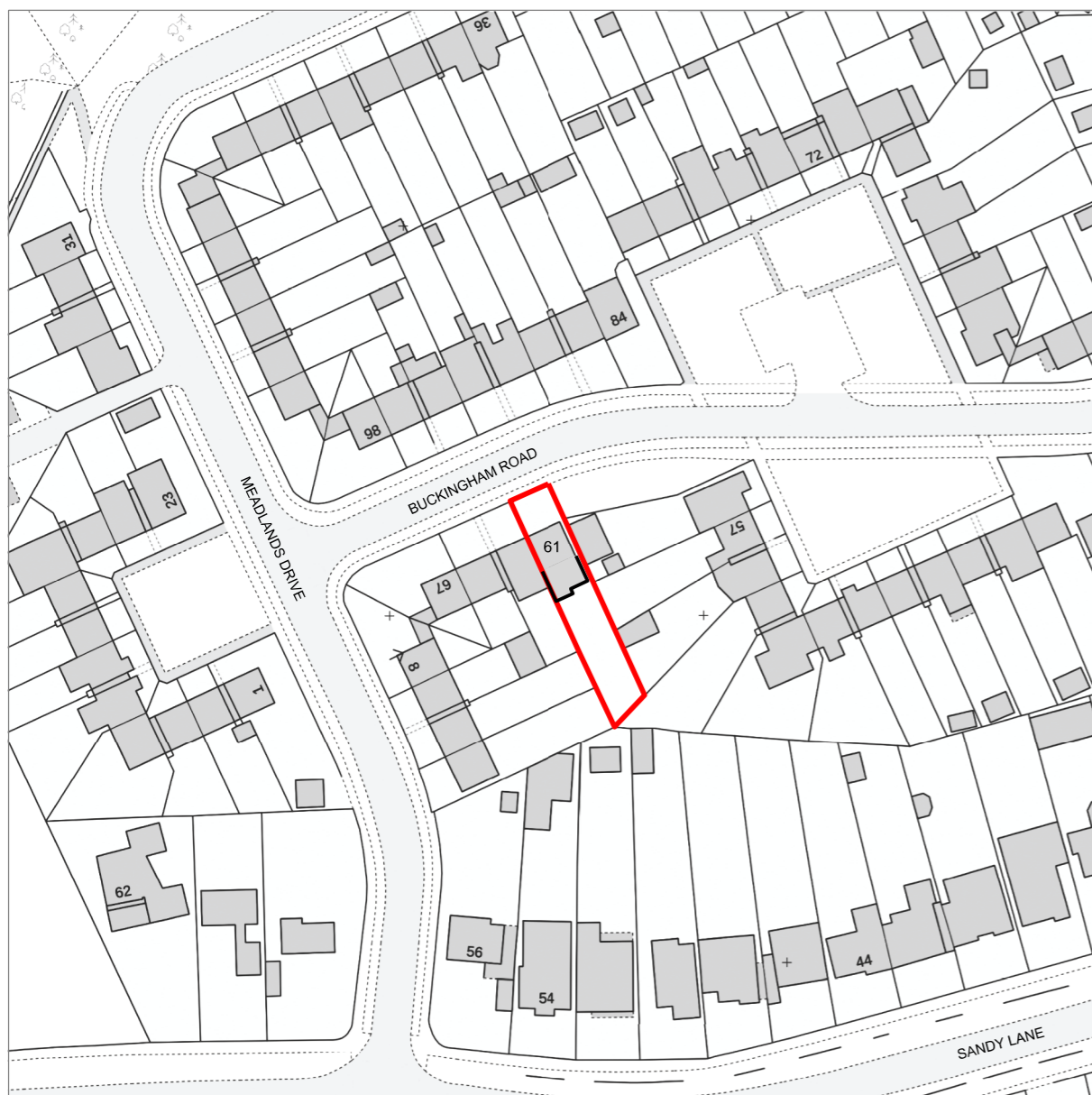
01 BLOCK PLAN SCALE 1:1250

NOTE: 1. Do not scale from these drawings, use dimensions only. 2. Contractors are to check all dimensions prior to commencement on site and notify the architect of any errors, omissions, or discrepancies. 3. Unless otherwise agreed in writing, all rights to use this document are subject to payment in full of all charges. This document may only be used for the express purpose, project and client for which it has been granted and delivered, as notified in writing by Hut and Castle Architects Ltd. This document may not be otherwise used or copied.