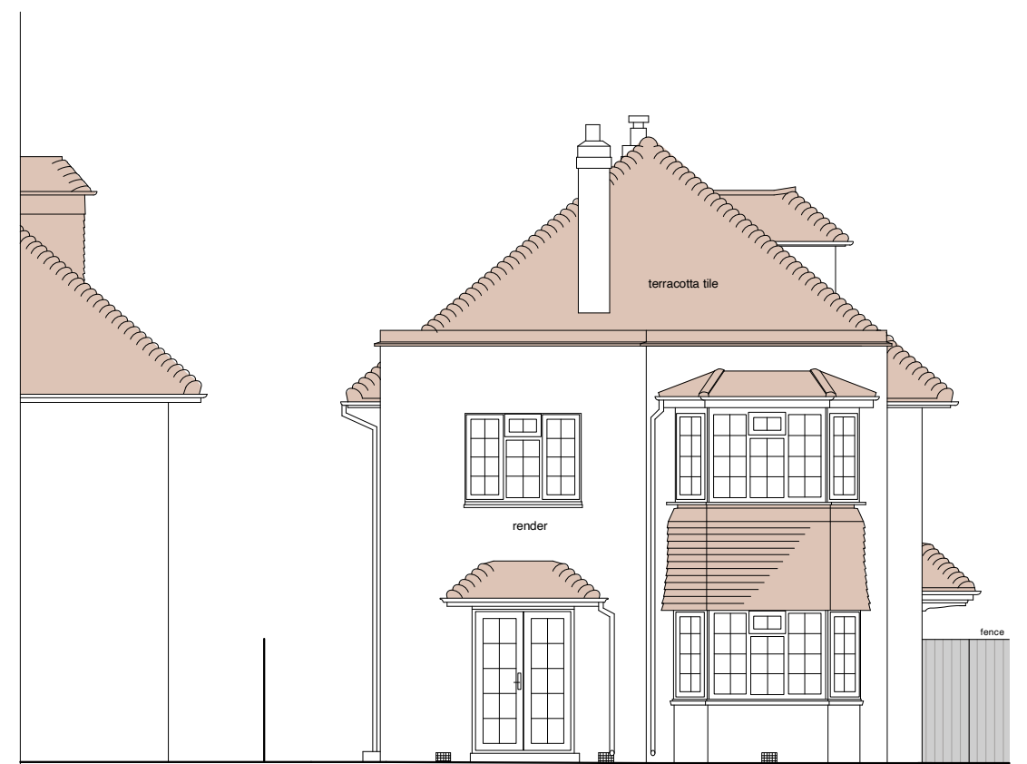
NORTH ELEVATION EXISTING