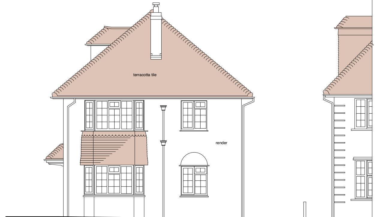
SOUTH ELEVATION EXISTING