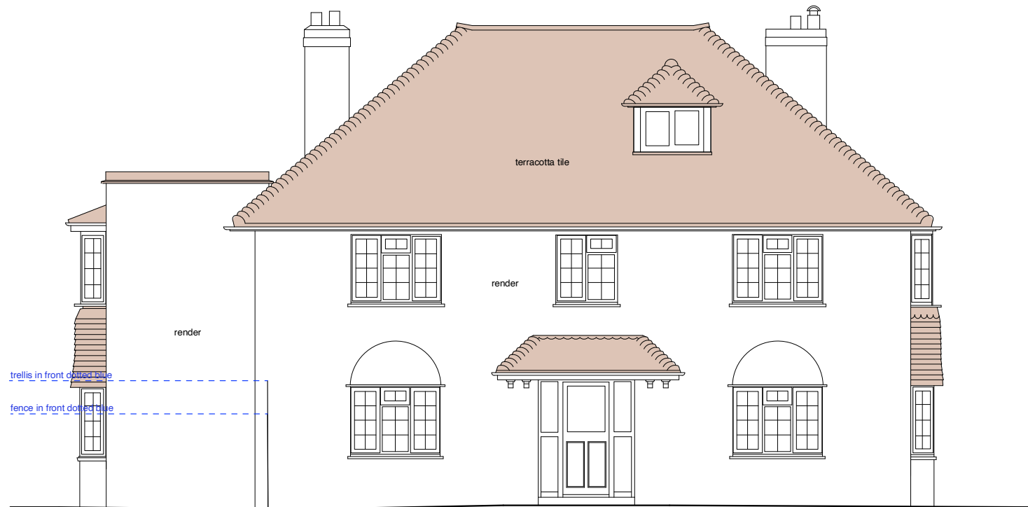
WEST ELEVATION EXISTING