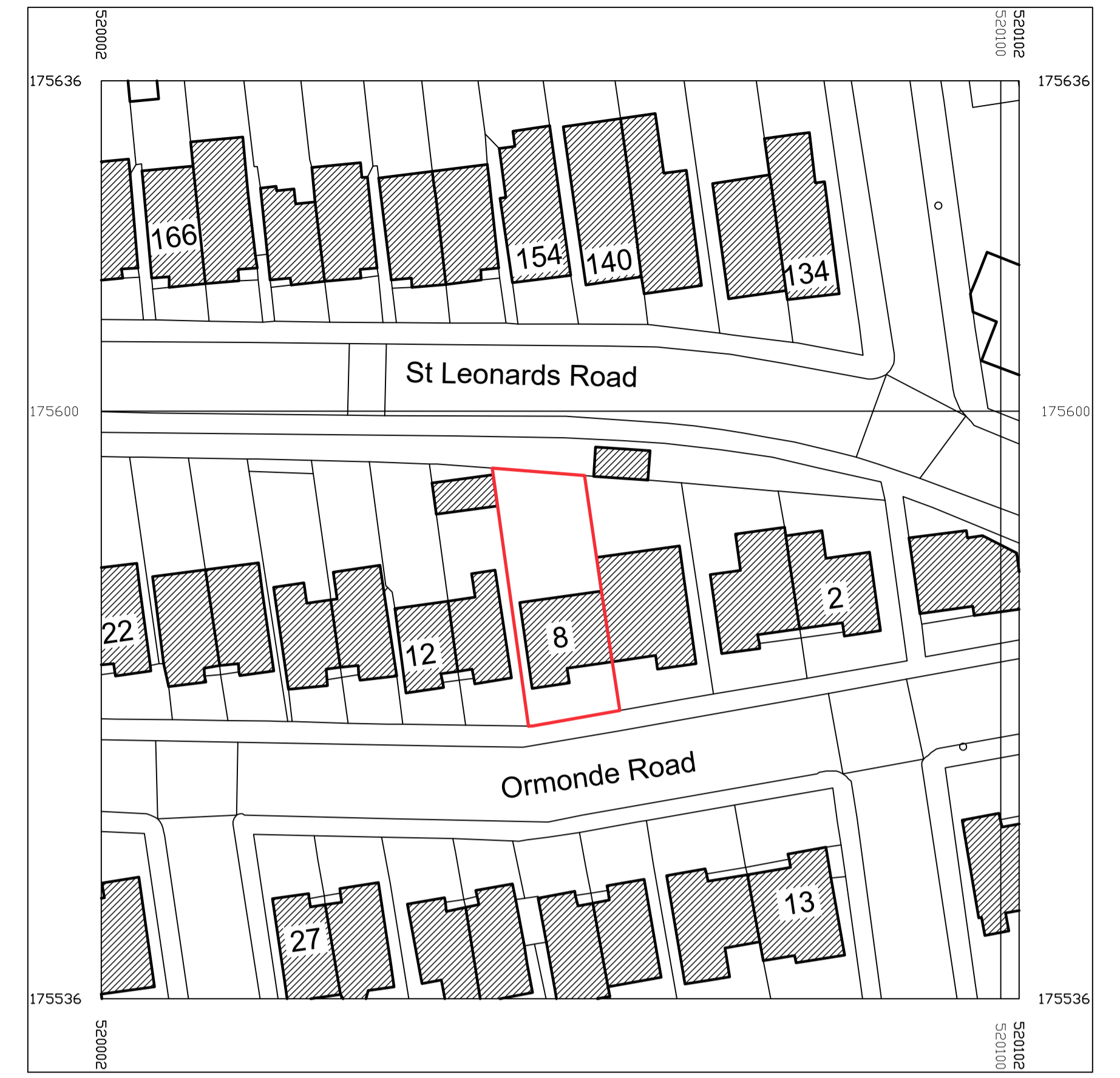
2 Proposed Block Plan Plan [1:200]

Serial number: 194032 © Crown copyright and database right 2020 Ordnance Survey licence 100048957 Reproduction in whole or in part is prohibited without the prior permission of Ordnance Survey 0 5m 10m 20m 50m SCALE 1:500@A1 3 Location Plan Plan [1:500]