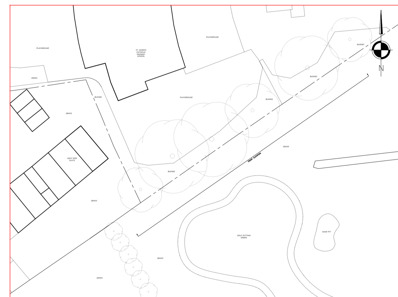
EXISTING BLOCK PLAN 1:500