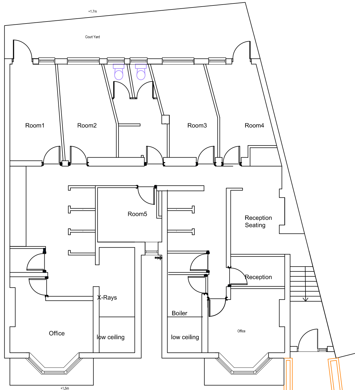
EXISTING BASEMENT FLOOR PLAN