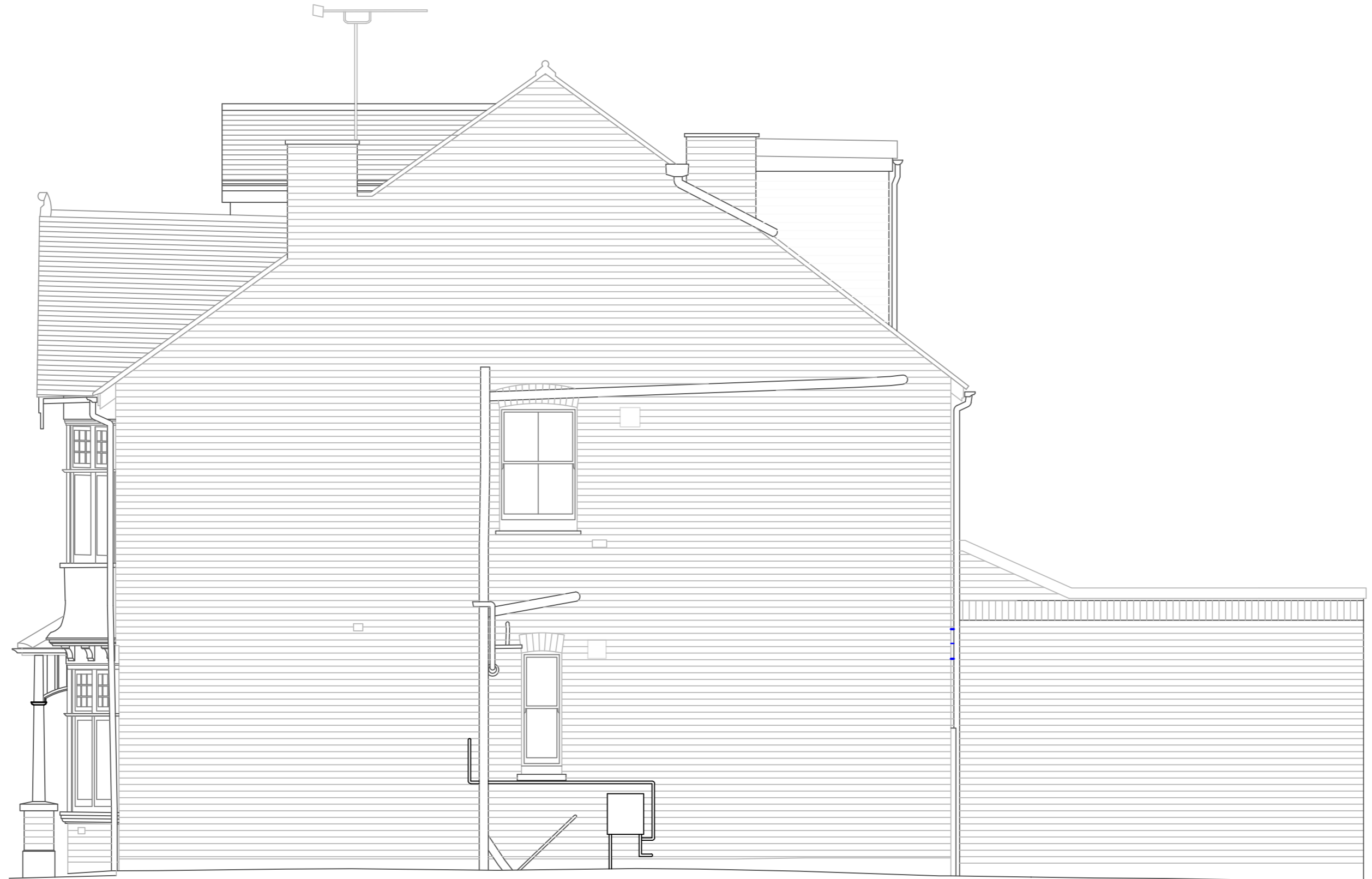
PROPOSED FLANK ELEVATION

Contractor to ensure all proposed drainage is in accordance with Part H of the Building Regulations.