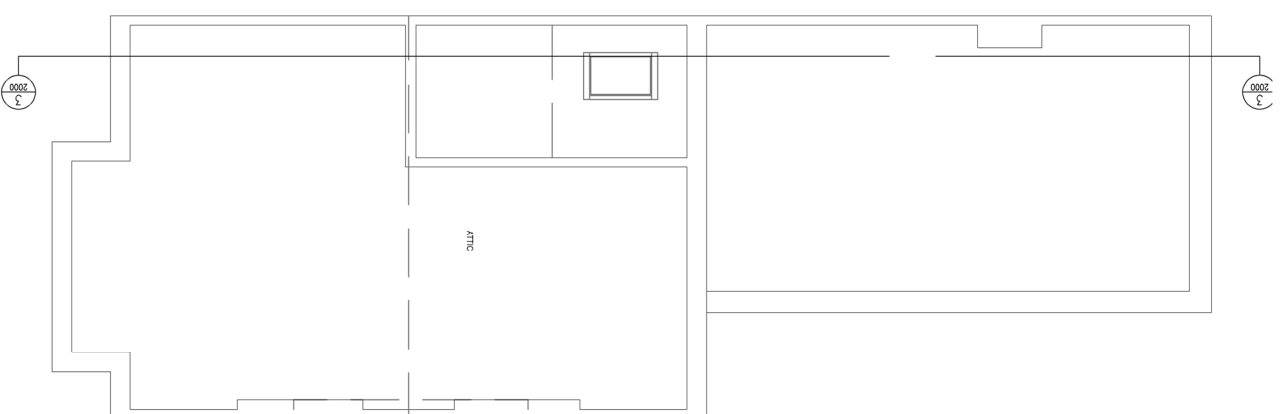
03 | EXISTING LOFT PLAN 1:100

NO CHANGE TO THIS FLOOR AS PART OF THIS APPLICATION